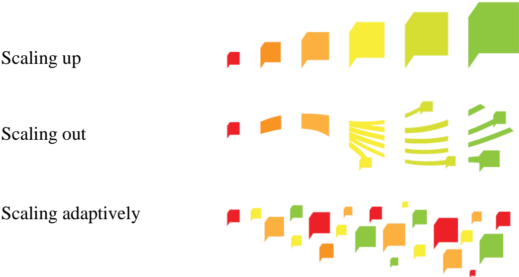
Figure 1. Scaling strategies and scaling patterns (after Woodhill et al 2012)

There is a number of expressions used around scaling strategies and scaling processes, and some of these obviously relate to how scaling is approached. Our standpoint here is clearly that scaling is more