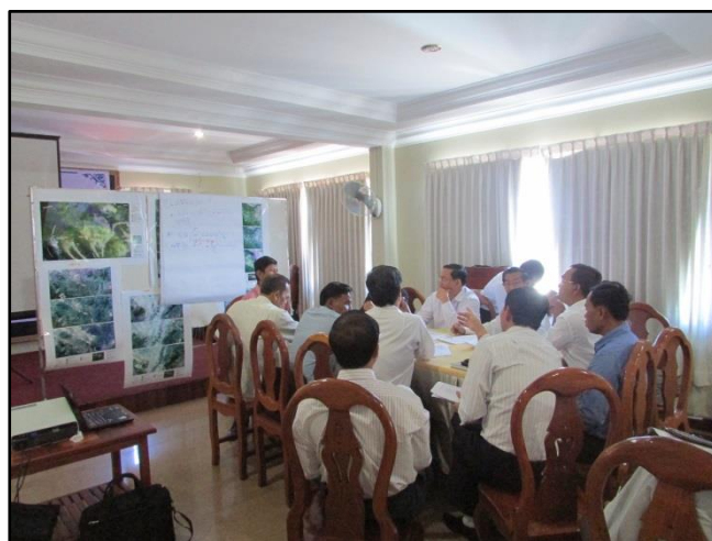
MSP participants considered the research results, and debated actions to resolve identified problems.

Water governance in Stung Pursat catchment is diverse and complex. The MK 16 project revealed eight primary resource users and fourteen secondary resource regulators. Stakeholder groups included: community groups, civil society organizations, government agencies at national, provincial, district and municipal levels, village communities, private companies, and development partners.