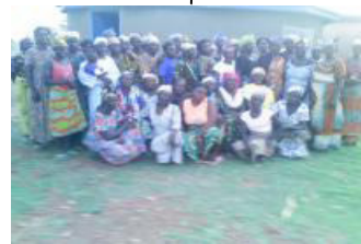
Women group at Baara