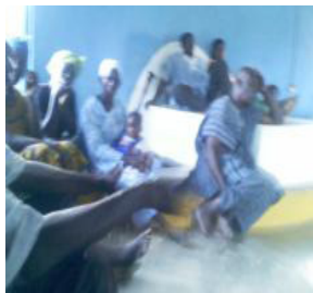
Chief of Baara