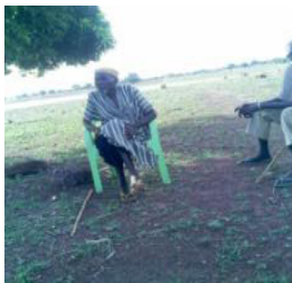
Chief of Nafkulga

Key informant (chiefs, tindana, clanheads, and some water users) interview guide was used