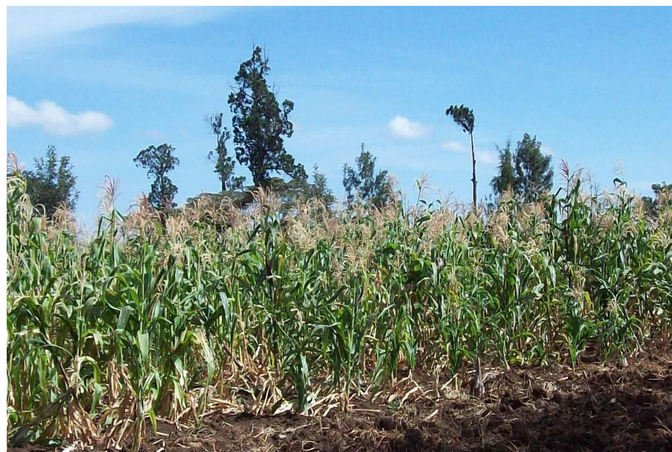
Small-scale maize plantation in Kenya