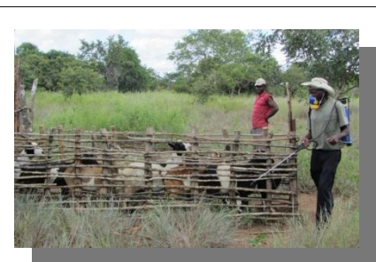
Fig. 1. Community Animal Health Worker treats goats against ticks

In Mozambique, there are no animal health services for goats despite disease occurrence being one of the main production constraints. CARE had experience with training paravets 1 (community animal health worker, Figure 1) to treat cattle in the local context. Based on this experience, 16 paravets were trained to treat goats. Based on this proven model, CARE and ILRI took the initiative at the project start. The innovation contained a technological component – e.g. treatments against ticks – as well an organisational component, e.g. paravets started working together with producers, community leaders and local government staff. Existing extension and training models were refined, but otherwise limited changes were required. As such, also limited flexibility was asked from the project partners. Due to CARE’s experience and the biweekly meetings of CARE extension officers with each paravet, the pace of the process was rather quick: within 2 years 16 paravets had