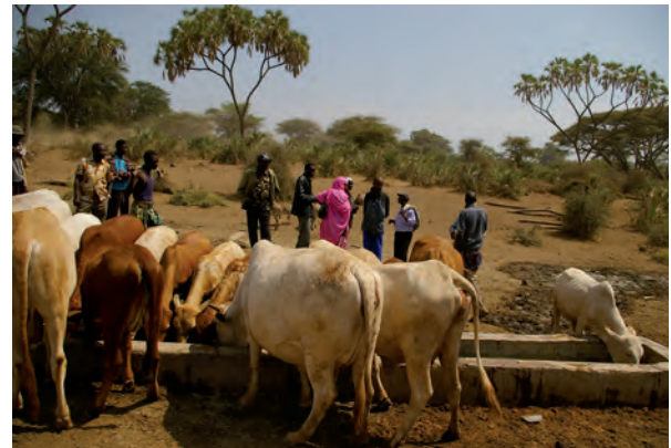
Plate 2: Cattle at the watering trough