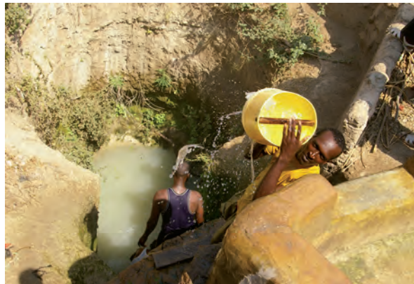
Plate 1: DHEDA well

Future plans of the CBO are to increase the political and legal weight of these traditional Boran regulations by having them made an integral part of their local laws under the new provisions that are catered for in the new Kenyan Constitution. This would solidify and properly enforce the resource management strategies of DHEDA.