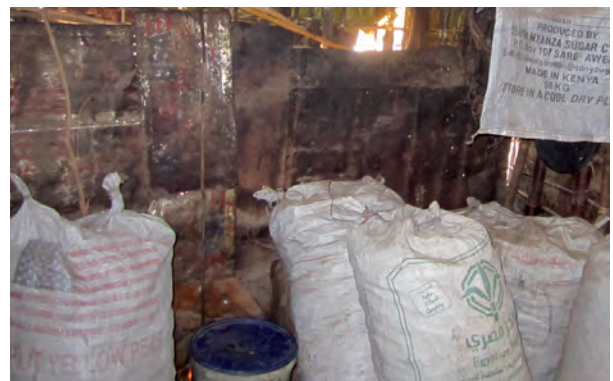
Plate 28: Hay storage in bags