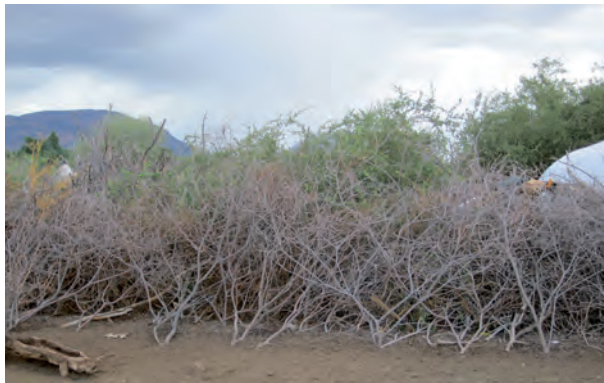
Plate 9: Traditional acacia branch boma

In areas where there is a high incidence of leopards, the livestock keepers will still have to guard their animals at night. This type of fence does not protect the animals from such predators, as they can jump over it and still attack the livestock.