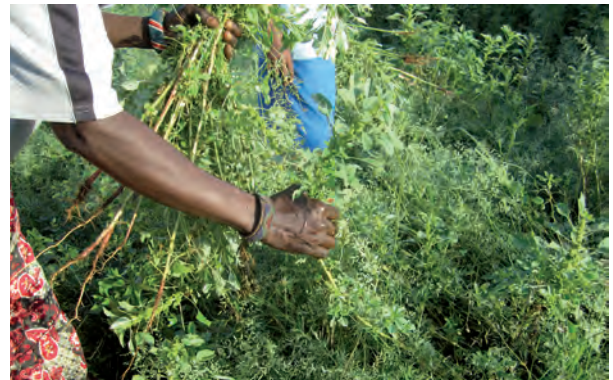
Plate 26: Weeding grass garden