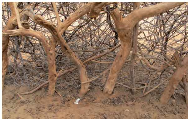
Plate 13: Salvadora posts