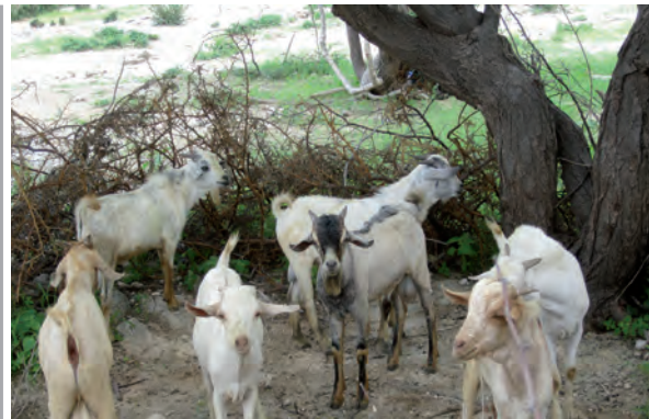
Plate 4: Goats in a "boma" at the market