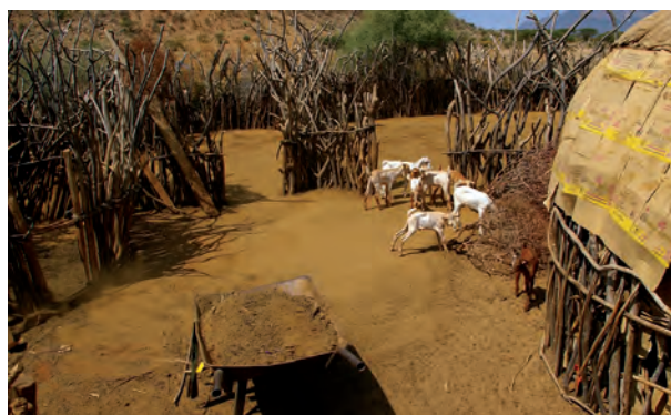
Plate 23: Cleaning of the boma