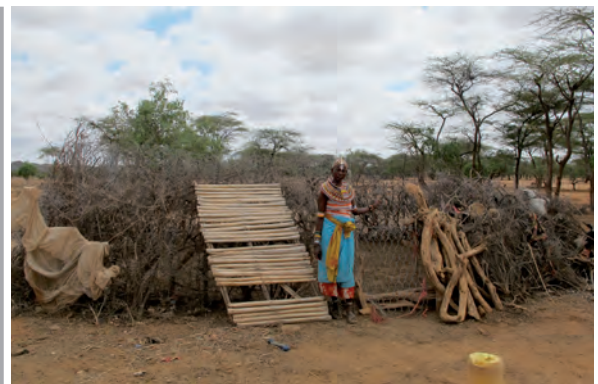
Plate 12: Chain-link boma fence