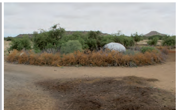
Plate 22: Surrounding acacia branches