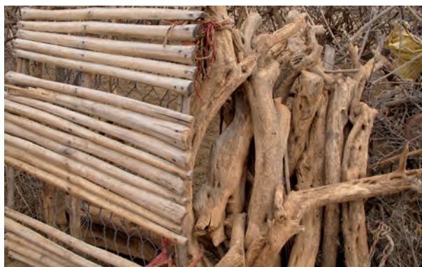
Plate 15: Secure boma door