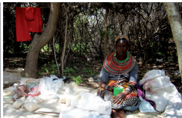
Plate 8: Household goods trader