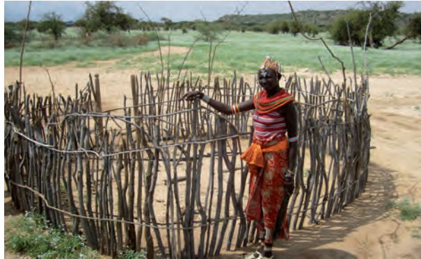
Plate 17: Cordia post boma