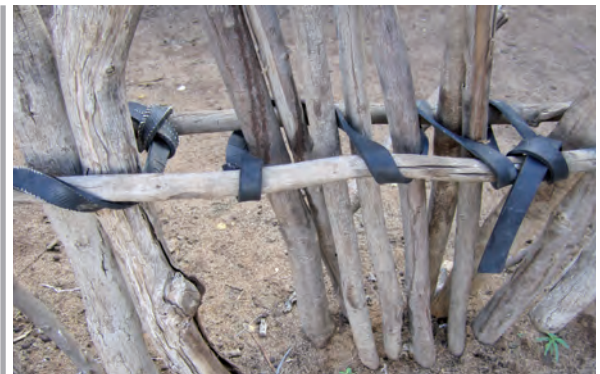
Plate 20: Rubber binds cordia branches