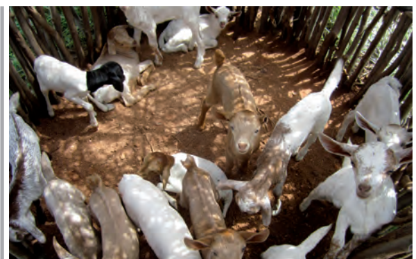
Plate 24: Young animals are kept separately