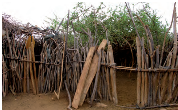
Plate 21: Boma entrance