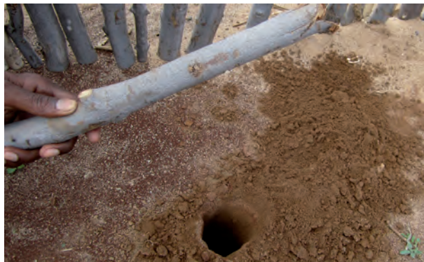
Plate 19: Individual hole, two hand lengths deep