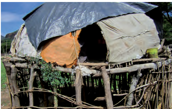
Plate 27: Stilt storage