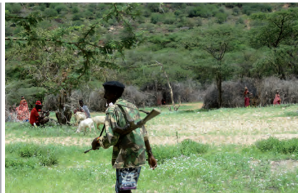
Plate 6: Market security