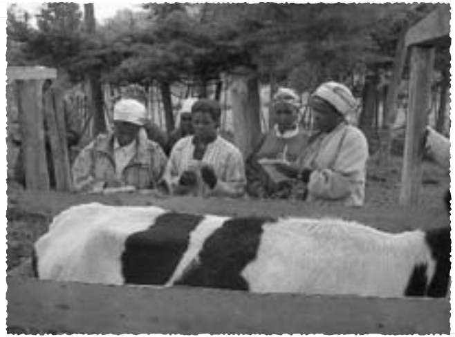
Recording general information for the AESA.

Using the FFS approach, the project is developing an innovative process through which farmers adapt existing technologies and try out new ideas. These ideas are developed through interactions between farmers, scientists and extension workers. This unique relationship is an excellent platform for epidemiological studies using participatory methods, to disseminate information on disease prevalence, to design relevant participatory technology development, and to introduce more successful disease surveillance and control strategies.