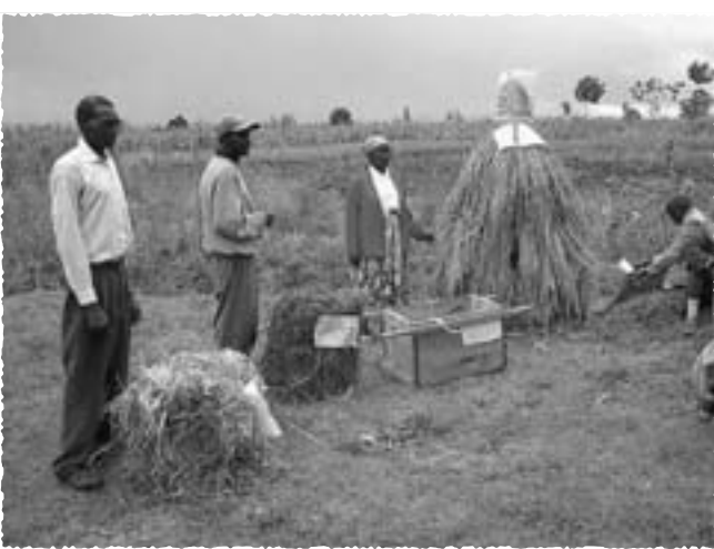
Presentation during a field day of fodder conservation techniques.

Not every problem can be easily dealt with using a “learning by doing” approach. Some problems, such as those relating to contagious diseases, for example, are not suitable or too dangerous for experimentation. Others may be too abstract to be demonstrated physically, such as the importance of epidemiological status or immunological reactions, and these can be addressed in special topic sessions where issues are discussed. Since the facilitator cannot be an expert in every subject, he or she will help the farmer group to invite the right person to talk about the subject chosen by the farmers. This empowers the FFS group to contact other organisations such as NGOs or national or international research institutes. Special topics can also include livestock and non-livestock related issues, giving farmers the chance to access the information that addresses their priorities at a particular moment. For example, talking to the community