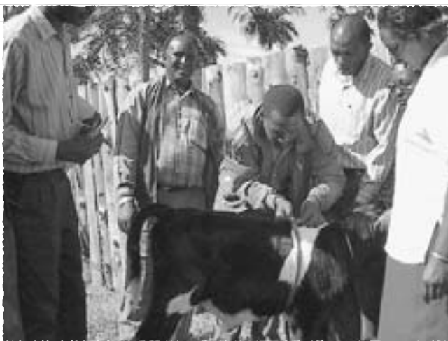
Measuring girth for the evaluation of body life weight.

Since the main objective of the FFS is to develop farmers learning skills, rather than to increase knowledge on a particular technical issue, record keeping and accurate observation are important components. Agro-ecosystem analysis is designed to improve observation skills and to develop decision-making skills, and this technique is utilised to record and observe the results of the PTD experiments. This observation process forms the basis for understanding the interactions between livestock and other elements of the ecosystem, as they relate to the problem or technology being studied. For example, where the subject is expected to have a direct outcome on the animal, such as a feeding or health management practice, the AESA is focused on the animal.