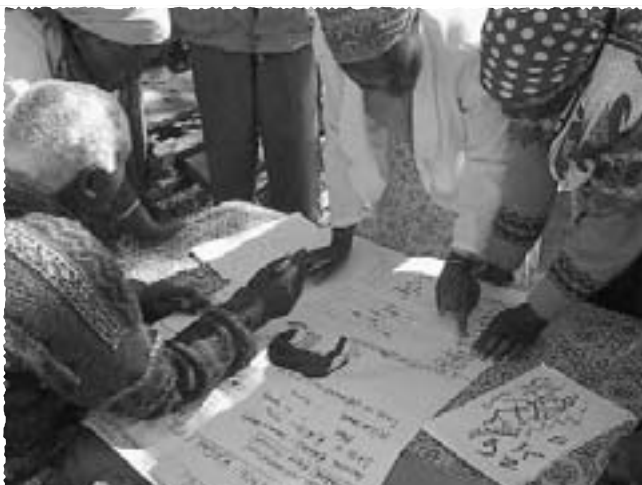
A sub-group prepares their AESA presentation.

Currently, over 1000 Farmer Field Schools (FFS) on integrated pest management (IPM) and/or integrated soil management are being successfully implemented in Kenya - and many more in Africa as a whole. Can the FFS methodology be developed for similarly complex issues like animal production and health, where responses to interventions may not be as fast?