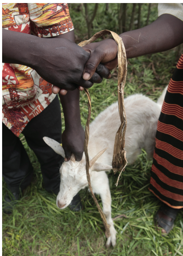
Women often face constraints in participating in markets

In Mozambique, there was almost equal management of income between men and women although women managed a smaller proportion of the income from chicken than they managed from cattle, sheep and goats. Women in Mozambique are very involved in the marketing of livestock, especially goats, for which there exists a thriving trade, mainly controlled by women traders.