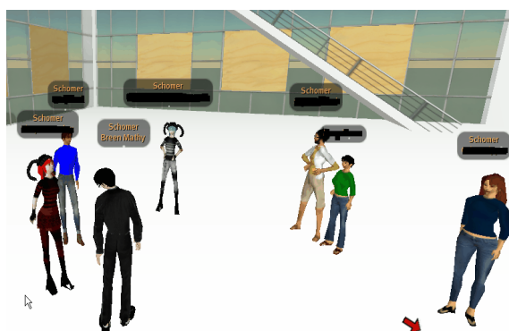
Figure 3 –Participants attending an orientation meeting

Three orientation meetings were held (see figure 3), followed by seven mathematics tutorials. The initial sessions were deemed essential to allow students to overcome technical problems and learn about the environment. Written material was circulated beforehand and then discussed during the tutorials.