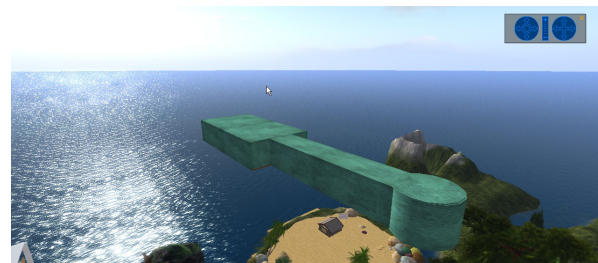
Figure 4 – Enclosed location used for tutorials

To investigate how the situational setting affected education within the tutorials a variety of different situational settings were used for the tutorials. These were devised according to three separate factors; realistic to surreal, enclosed to open, formal to informal (see figure 4). The specific situations used were: two different platforms in trees, one which had couch-like seats, a purpose-built enclosed classroom and corridor in the sky, the same room with the roof removed, a purpose-built chessboard room with wall and chairs, and a bandstand.