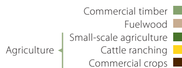
Figure 1: Agriculture as the main driver of global deforestation (% area). Two regions are also shown to illustrate the differences among regions. (Source: Blaser and Robledo 2007). Note: These figures are illustrative; different datasets show somewhat different patterns, and many drivers of deforestation are intertwined in complex sequences of causality.

Agriculture contributes to about three-quarters of tropical deforestation (Figure 1). Although much of this deforestation is the result of both small-scale agriculture and industrial or commercial agriculture, ranching is also an important driver of deforestation. The drivers of deforestation differ significantly amongst regions and amongst countries within regions, which highlights the necessity of tailoring policies and plans for REDD+ and climate-smart agriculture to national and local contexts. Drivers also change over time, as demonstrated by the increasing importance