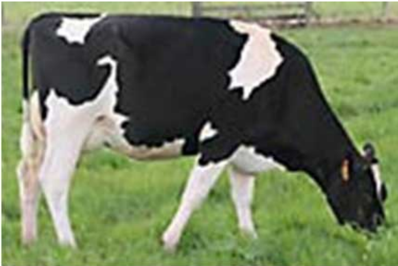
New Zealand Friesian cow in a pasture based production system