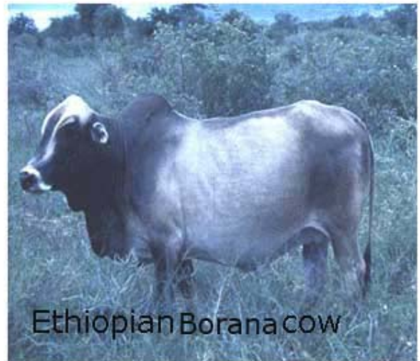
Ethiopian Borana cow

Boran bull photo taken by A.M.Okeyo at ADC-Mutara, 1994