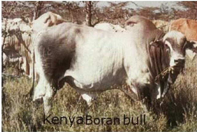
Kenya Boran bull

Boran bull photo taken by A.M.Okeyo at ADC-Mutara, 1994