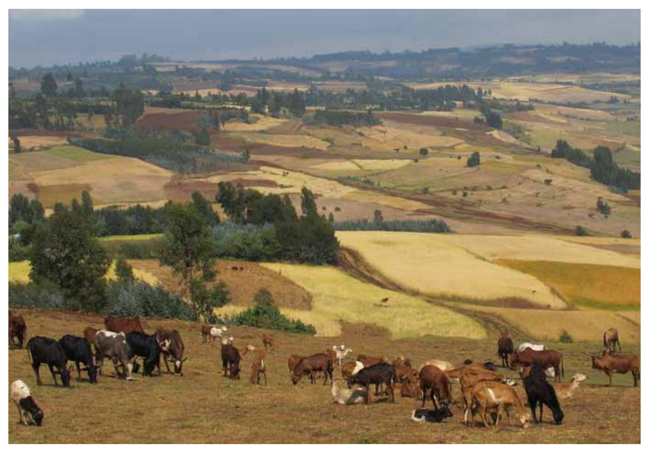
Nile River Basin: Crop-livestock systems in Gallessa, Ethiopia

Suggestion: Evaluators should use the project outcome and impact models to help determine the data needed for the evaluation, as well as for designing the data collection methods to be used.