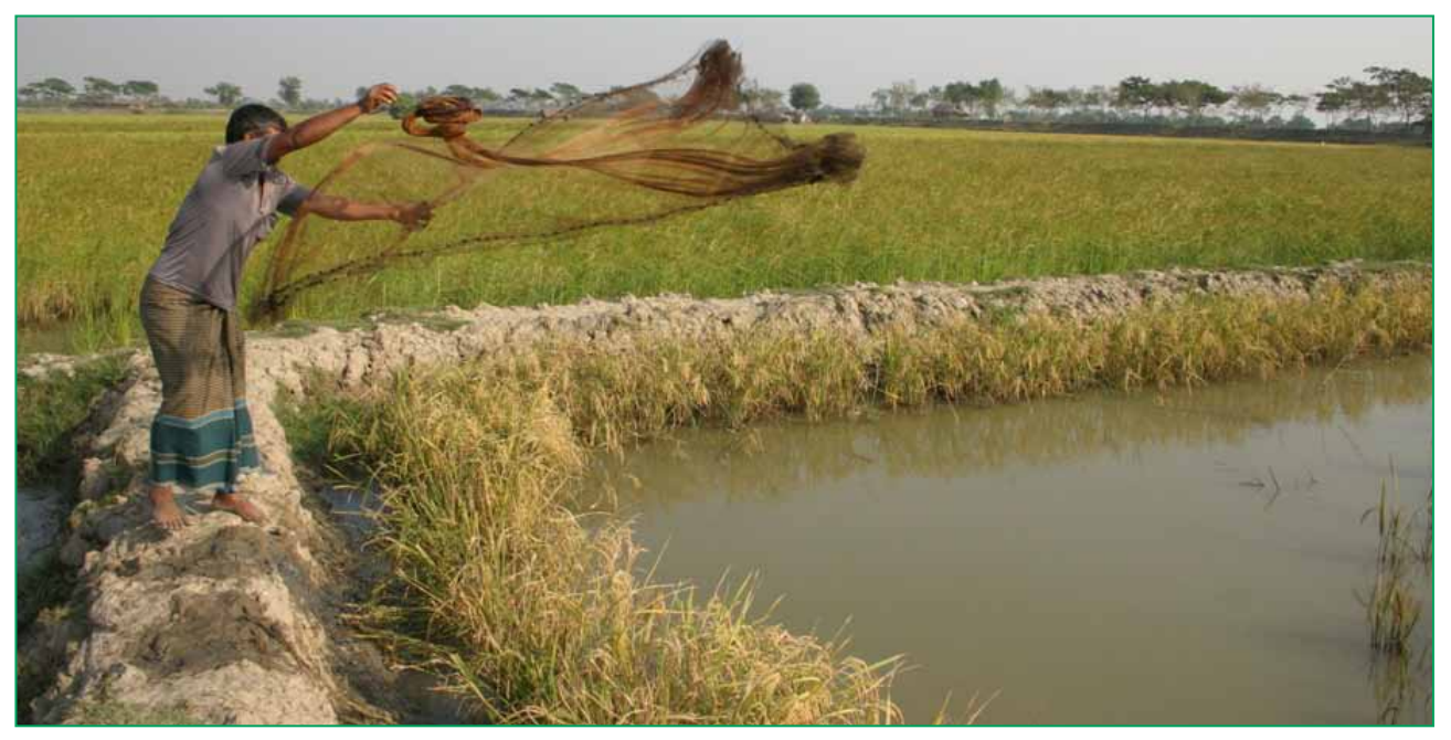
Managing Water and Land Resources for Sustainable Livelihoods at the Interface between Fresh and Saline Water Environments in Vietnam and Bangladesh