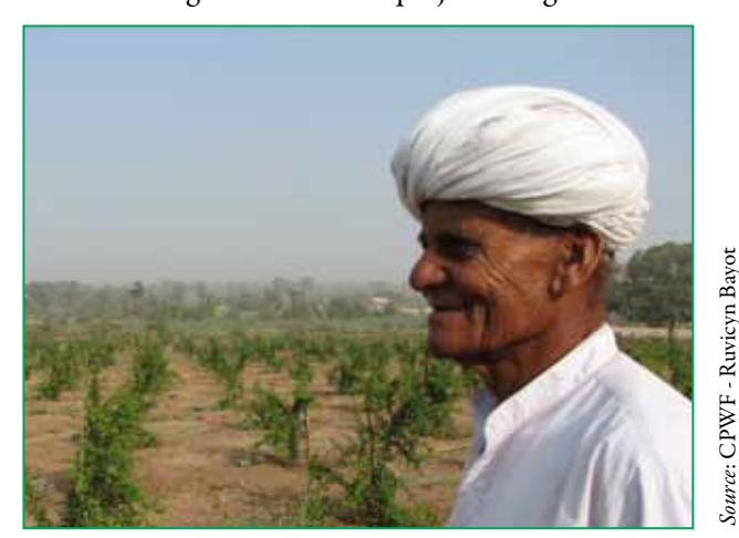
Ganges delta project

A modest advisory committee might comprise: