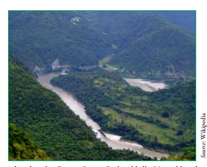
A bend in the Ganges River, Garhwal hills, Uttarakhand

The external review of CPWF (Biswas et al. 2008) and the Consultative Group on International Agriculture Research (CGIAR) strategic guidance on conducting impact evaluations argue for evaluations of projects to include an analysis of the ex-post benefits and costs of the project. The analysis is expected to include data on cost and results to date and estimates of future benefits and costs. The four evaluations reviewed displayed a wide range of approaches to cost-benefit analysis (CBA), ranging from a short narrative to quite detailed economic assessments replete with many assumptions about the future. What is reasonable to expect from these CPWF projects? What kind of information on costs and benefits would be most useful to CPWF and its donors?