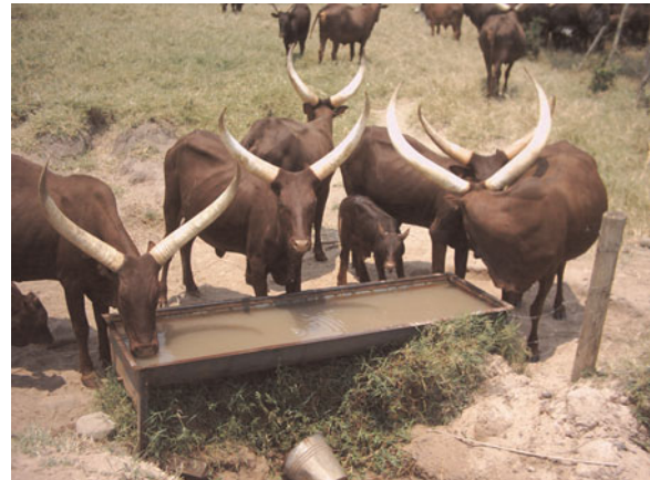
Plate 5. Ankole cattle at the water trough.

improved by saving grazing areas in the form of standing hay or establishment of fodder banks for dry season feeding (Mwebaze, 2002).