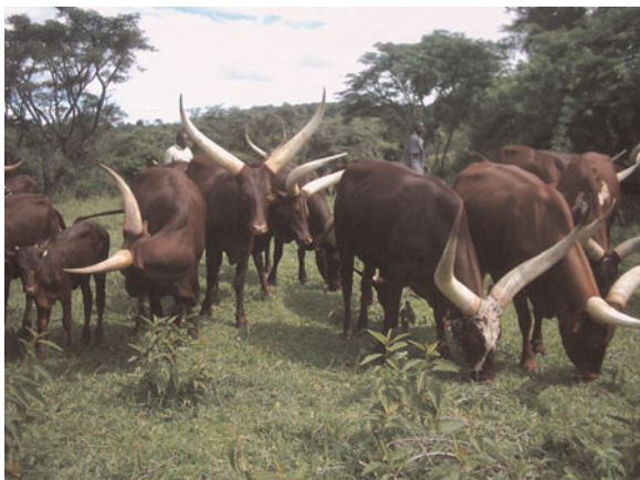
Plate 4. A herd of Ankole cattle grazing, note the tree cover on the range.

Agropastoralists are sedentary farmers who cultivate food crops both for subsistence and sale while also keeping livestock. Their animals use communal grazing land, fallow land and crop land after harvest (Twinamasiko, 2001). Livestock is used for draught, savings and milk production. The agropastoralists have little control over the feed resources. Milk production fluctuates with the seasonal availability of feed; hence, feed supply could be