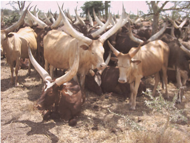
Plate 9. Three generations in one photograph, standing in the front row, from left to right is a dam, daughter and grand-daughter.

affected ( P > 0.05 ) by LPS and counties (Table 3). Average age at first calving (AFC) was 33.2 \pm 0.5 months, and ranged between 24 and 45 months. Gomba and Kiboga counties had higher AFC ( P \leq 0.05 ) than the other counties. Calving interval (CI) averaged 12.9 \pm 0.8 months and ranged between 12 and 18 months, but did not differ significantly between LPS and counties. The average lactation length (LL) differed between LPS ( P \leq 0.01 ) and counties ( P \leq 0.001 ). LL was 5.5 months for the crop livestock, 6.3 months for agropastoral and 7.4 months in pastoral areas (Table 3). Kazo County had the highest mean LL (8.5 months) that differed ( P \leq 0.001 ) from the rest.