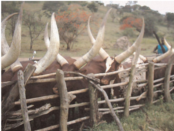
Plate 7. Ankole cattle in a confinement crush during spraying against ecto-parasites.

the feed resources and therefore limited opportunity for their improvement. The pastoral system uses few commercial inputs and the cost of production is usually very low (Mwebaze, 2002).