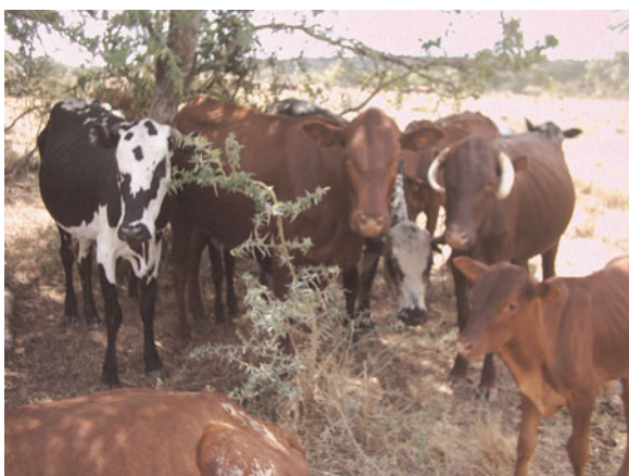
Plate 8. The diversity of the homing condition among Ankole cattle. The names of the cows standing from left are Kachweka (i.e. broken horns), Nkungu (i.e. polled), Nshara (i.e. drooping horns).

A questionnaire was administered to the 248 households to generate data on reproductive parameters in cows and bulls. Milk production data were provided by farmers who relied on their memorized records. One mature breeding bull and one cow were then randomly selected from each surveyed household. Live body weight (BW) and six body measurements were then taken on the selected 120 bulls and 180 cows. The studied animals were mature active breeders. Maturity was ascertained from possession of either three or four pairs of permanent teeth. A descriptor list of phenotypic characteristics to assist with the qualitative description of the animals, a colour chart to describe the coat colour of the animals, and calibrated tapes and callipers to measure the quantitative physical characteristics such as heart girth (HG) and body length