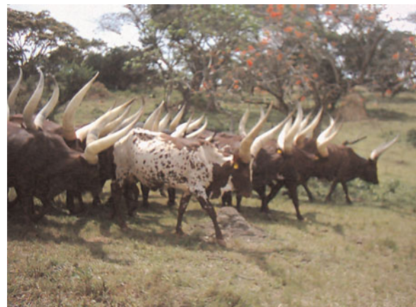
Plate 6. Ankole cattle approaching home, note the long and graceful horns.

Pastoral systems are characterized by the use of range grasslands, migratory herding and livestock breeds that are tolerant to migration stress, droughts and periodic food and nutritional shortages (Groombridge, 1992). Livestock owners exploit natural grasslands mainly in the relatively dry areas of Uganda (Twinamasiko, 2001). Pastoralists are more sedentary today than in the past, and mainly move to find pasture and water in times of drought. The main source of food for pastoralists is milk; however, production per unit area is low (Petersen et al. , 2003). Producers generally have minimal control over