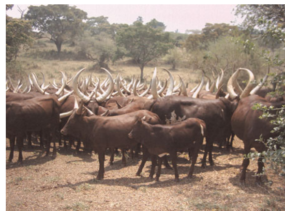
Plate 2. An Ankole cattle herd of mostly the one preferred colour, dark brown ( Bihogo ).