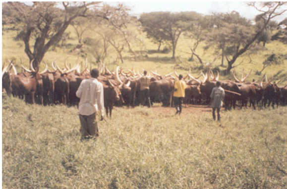
Plate 3. A herd of Ankole cattle being driven to graze.

and Mawoggola in Sembabule district (Table 2). Each county ( Ssaza ) is further divided into subcounties ( Gombolola ) that are decentralized governments. The subcounties are made up of several parishes ( muluka ), each of which is subdivided into villages whose residents form the local council one, the smallest administrative unit.