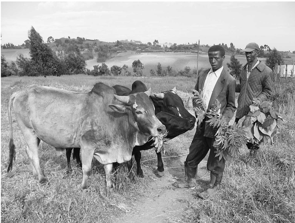
FIGURE 2 Farmers demonstrating the palatability of H. abyssinica and D. torrida at Galessa, central Ethiopia.

Ethiopia (Figure 1). The altitude ranges from 2900 to 3200 masl. The rainfall pattern is bimodal. The main rainy season is from July to September, and annual rainfall is 1399 mm. The soils are classified as Haplic Luvisols. The original vegetation in the area was mainly