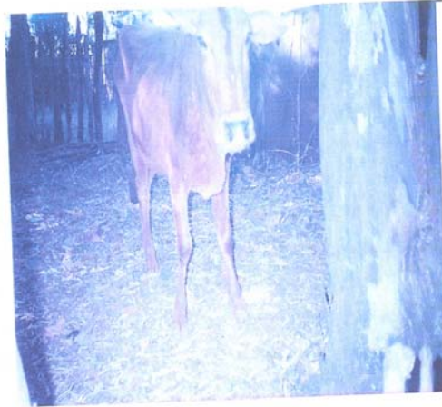
FMD—salivation hangs like string