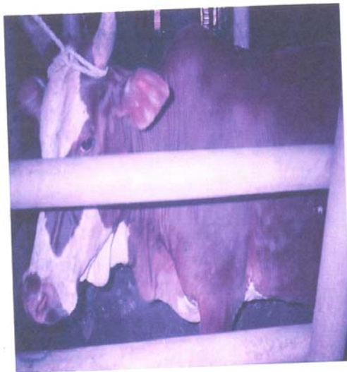
Lumpy Skin Disease