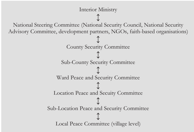
Figure 2. Kenya’s Devolved Peace and Security Institutions

velopment Network), international organisations (Saferworld, Mercy Corps, etc.), and development partners (for example, USAID). 15