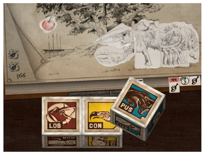
Figure 1. A screenshot of 'Gua-Le-Ni; or, The Horrendous Parade'

As part of its biometrics-guided tuning and design iterations, the 'Gua-Le-Ni' videogame underwent two consecutive sessions of psychophysiological measurements. From a game design perspective, the two separated sets of experiments were aimed at tackling particular aspects of the game which had a specific hierarchy and relevance within the time line of its design iterations. Consequently, in order to be effectively applicable to the design process, dedicated tests needed to be run in specific phases of the design process.