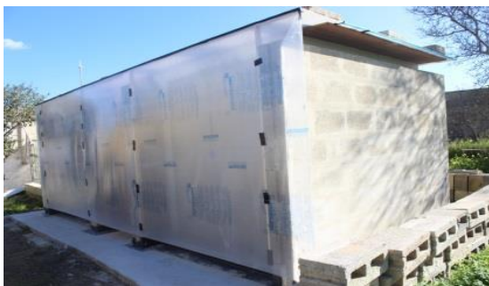
Figure 3: Northern side view of insitu test cells with polycarbonate sheeting protecting the test walls

One test cell (Test Cell 2, on the right hand side, Figure 3) has a standard local HCB wall, whilst the test wall in the other cell (Test Cell 1, on the left hand side, Figure 3) is replaced after every test with a different prototype HCB wall.