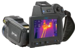
Figure 9: FLIR T640 Infrared Camera

surface of the test wall in order to calculate the U-value of the building elements. The infrared method being developed by Kato et al [6] – a method which would eventually contribute towards the development of ISO WD 9869 Part 2 – was adopted in this study. Figures 9 and 10 below illustrate the equipment used for the infrared technique.