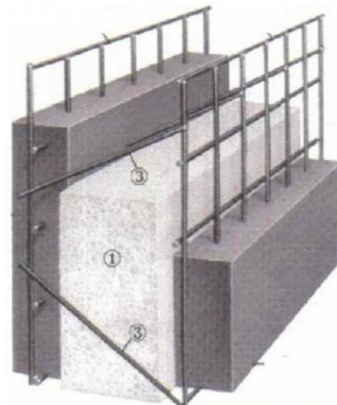
Figure 2: EVG-3D Malta providing very good thermal insulation and economical use of material but deviating from the standard local construction system thus requiring new expertise.

Although highly effective in improving the U-value, these products and technologies do not actually address the conductivity value of the load bearing element itself, but achieve it through the introduction of additional insulating material. The ThermHCB project, of which this study forms part, was launched — under the Malta Council for Science and Technology (MCST) 2012 R&I Programme — specifically to address this concept, by developing an innovative HCB with enhanced thermal properties, while keeping the dimensions and structural strength of the local standard HCB. The objective of the project is to manufacture an innovative product that is structurally very similar to the traditional HCB but having improved thermal properties and made available on the market at a competitively reasonable price.