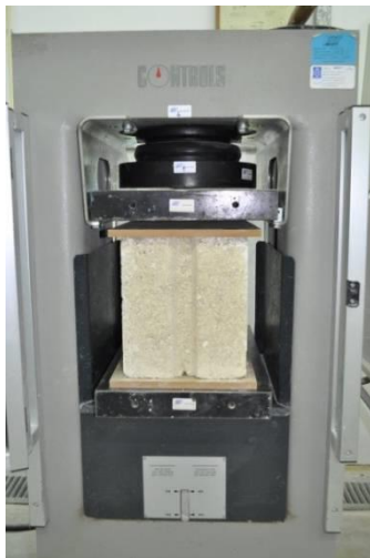
Figure 11: Equipment set-up for compressive strength testing (fibre board rapid test BS 6073-1:1981)

Compression testing was done at the Laboratories of the Faculty for the Built Environment, in accordance to BS 6073-2:1981. Dimensional testing was also carried out in accordance to the procedures stipulated in BS EN 772-16: 2000 and BS EN 772-20: 200. Figure 11 below illustrates the setup used to perform compressive strength testing on HCBs.