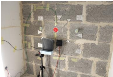
Figure 10: Thermal setup inside the test cell for both the infrared method

The use of two test cells was to carry out simultaneous insitu thermal testing on both standard HCB and ThermHCB walls under the same environmental conditions. This method of testing was possible when applying the heat flow meter methodology, but was not adopted for the infrared methodology due to costs. Funds available could not cover the purchase of two sets of infrared cameras to be set up in both test cells concurrently. U-values obtained from the infrared technique measurements were thus only compared to U-values obtained from measurements using the heat flow meter technique for the same test wall, with monitoring and collection of data taking place within the same period and thus under similar environmental conditions. This comparison strategy allows the validation of the infrared U-value measurements thus contributing towards the research and development of the ISO standard for thermal imaging, which is still in draft form.