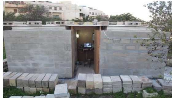
Figure 4: Southern side view of insitu test cells showing the data monitoring equipment area

flow could be assumed for the analysis, when steady state is reached. The test rooms were thermally controlled, to keep a constant interior temperature, using separate fan heaters and electronic temperature controllers.