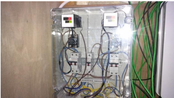
Figure 6: View of the data monitoring equipment used for the heat flow meter method as part of the Hukseflux TRSY01 datalogger system

The heat flow meter method was performed in accordance to ISO standard 9869 Part 1. This method makes use of heat flux sensors, which are made of thin thermally resistive plates with thermocouples, arranged in such a way that the electrical signal given by the sensors is directly proportional to the heat flow per square metre through the plate and subsequently the wall surface under it. Figures 6, 7 and 8 below illustrate equipment used for the monitoring and data collection for the heat flux meter methodology.