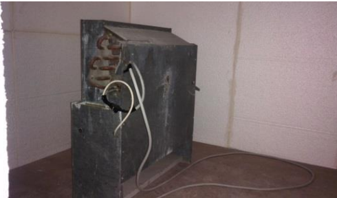
Figure 7: View of the heater unit used to maintain constant temperature inside the test cells