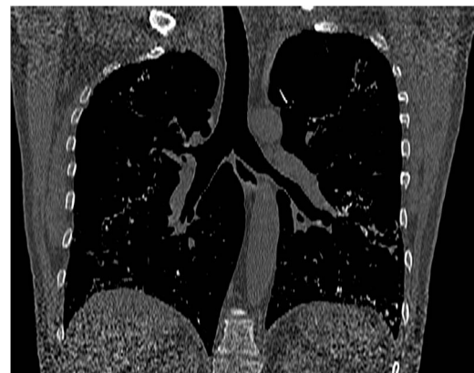
Figure 2 Coronal reconstruction of high-resolution CT thorax image as viewed in the bone window setting, highlighting the intra-alveolar calcifications and their distribution, mainly in the lung bases.

Calcium and phosphate metabolism is usually normal, and extrapulmonary calcifications are rare, although there are reported cases of associated cardiac valve calcification, cholelithiasis and nephrocalcinosis. 2