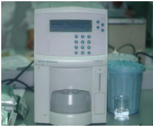
Fig. 1. Platelet Function Analyzer PFA-100.