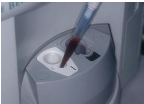
Fig. 3. COL/EPI cartridges with pipetting of blood sample in PFA-100.

Above these maximum times, the patient's platelet function would be altered. Thus, PFA can measure if the platelet function is normal, altered or even if it does not finally produce any closure. Closure times for healthy children are generally longer than in adults but are not significant. However, neonates have significantly lower times than healthy children (6). The times in hemophilic patients are normal, indicating that factors 8 and 9 of coagulation are not involved in the formation of platelet plug formation (6, 14).