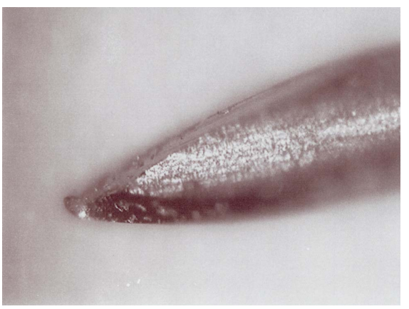
Fig. 1. Monoprotect® needle with non-preserved bevel after truncal block of the inferior alveolar nerve (100X).

No statistically significant association was observed between bevel deformation and the surgical experience of the operator, the working side, ipsi- or contralateral positioning of the operator with respect to the side of extraction, the truncal technique used (direct or indirect), the internal caliber of the needle or the number of bone contacts recorded on performing truncal anesthesia of the inferior alveolar nerve. However, a statistically significant association (p<0.05) was observed between bevel deformation and the operator performing the anesthetic technique (Table 2).