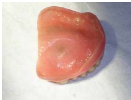
Fig. 3. Clinical image that shows the prosthesis's lesion impression.