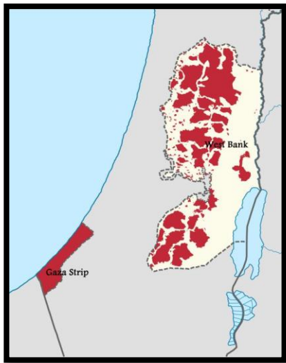
Figure 4.1: The West Bank and Gaza Strip