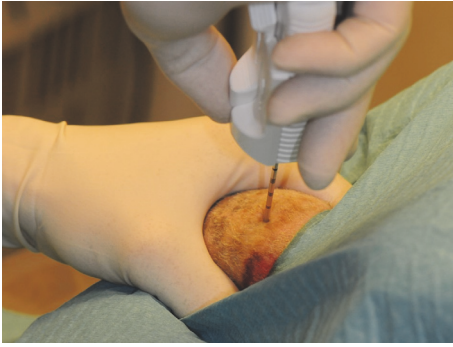
FIGURE 1: After razing and disinfection with chlorhexidine digluconate 0.5% in ethanol 96% and staining with curcumin, TESE was performed using a 14-gauge TruCut needle, which was introduced percutaneously through the scrotal skin and into the ram testis.

after TESA using a 19-gauge butterfly needle. However, 9 months later, it was not possible to refind the lesions [17]. In a minor study where most participants were diagnosed with OA, none showed abnormalities by testicular ultrasonography 3 months after TESE using a 14-gauge TruCut needle [18].