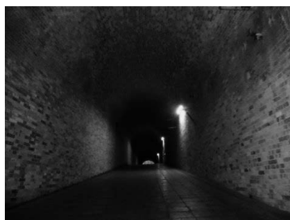
Figure 1: Brick structure in Sarushima

We investigate temperature and relative humidity in brick structures at Sarushima and analyze it what kind of salts exist in brick debris. Our result show that collapse of bricks is caused by some salts, environmental conditions such as temperature and relative humidity.