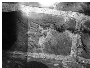
Figure 2: Salt weathering

Investigation on monitoring was carried out in 3 places such as d3 spot, f1-2 spot, and f1-3 spot from June 5 through June 29, and June 29 through August 2, 2017 in Sarushima (Figure 3). Behavior of temperature and humidity were measured by HOBO U23 Pro v2 Temperature/Relative Humidity data logger which was set to be measured every 30 minutes. Amount of collapsed brick was measured by tray containers set on brick walls and weighed it every one month. The number of trays which were set is 2 at d3 spot, 3 at f1-2 spot, and 1 at f1-3 spot. Brick debris which obtained monthly were analyzed by using X-ray diffractometer (Bruker AXS, NEW D8 ADVANCE) to identify salts in brick debris. The X-ray target was Cu, the tube voltage was 40 kV and the tube current was 40 mA.