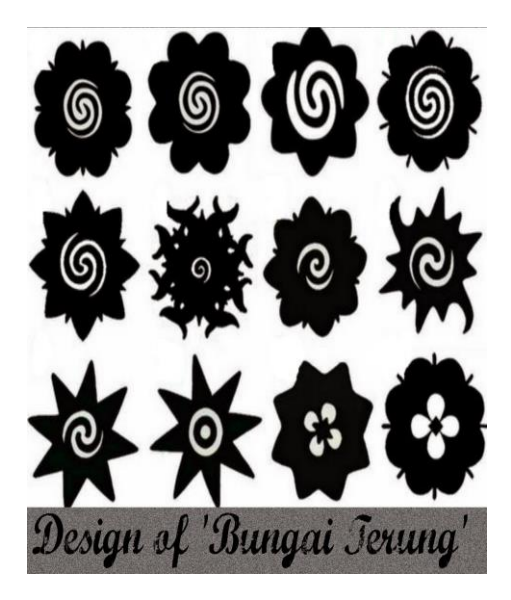
Figure 4: Variation of bungai Terung Motif.

This topic is deliberately chosen in response to the insistence on personal experience of researcher who feel the need to highlight this subject to the attention of the general public. Its main aim is to educate the general public that each motif applied on any objects associated with the material culture of the Dayak people should be handling with certain degree of respect.