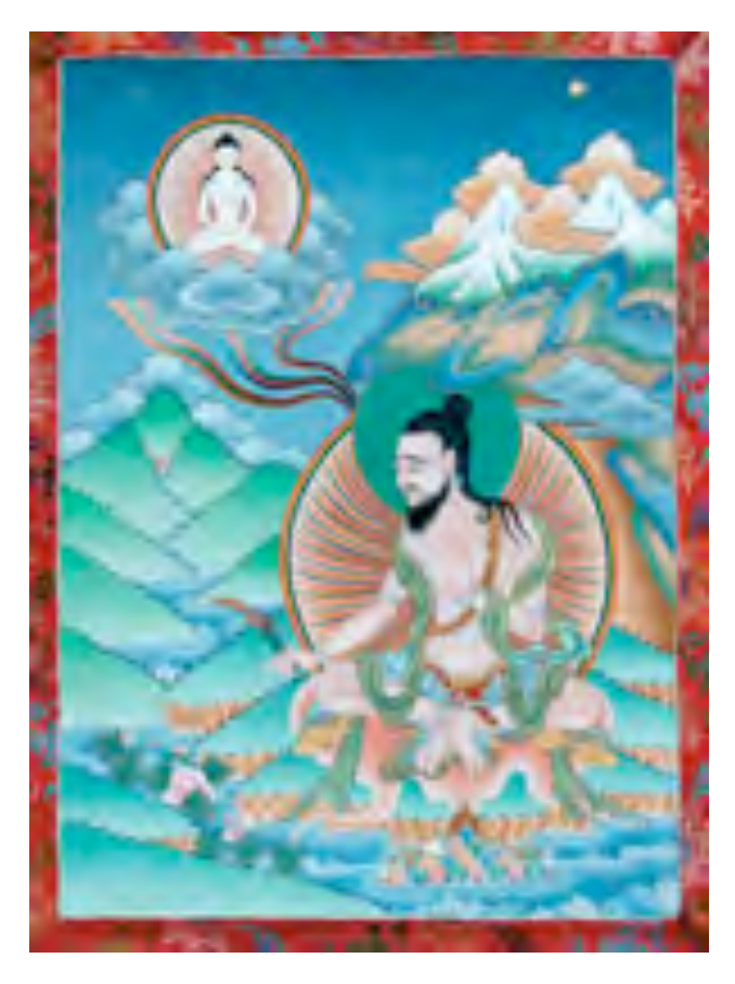
Figure 2: Gyer spungs chen po sNang bzher lod po in the moment of achieving the supreme realization after which he spontaneously composed the prayer to Ta pi hri tsa.

[all] other sentient beings, who are still caught up in their ignorance, remain behind in samsara. However, we have not abandoned them. Because we are now fully and permanently in the Natural State, the virtuos quality of the great compassion for all sentient beings, which is inherent in it, manifests spontaneously and without limitations. This compassion is total, the great compassion, because it is extended to all sentient beings impartially. And by virtue of the power of this spontaneous compassion, we reappear to Samsaric beings as a Body of Light in order to teach them and help guide them along the path to liberation and enlightenement.<sup>86</sup>