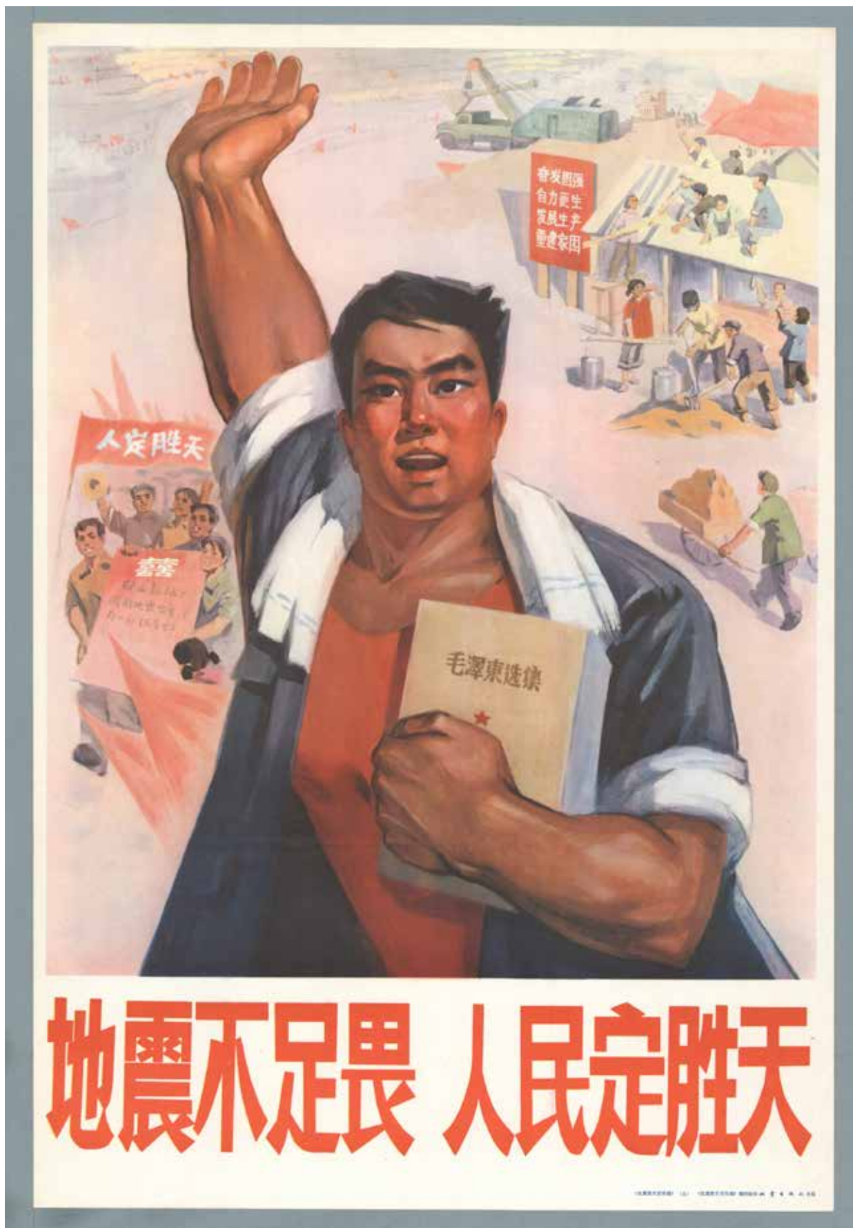
Propaganda poster referring to the Tangshan Earthquake, 1976.