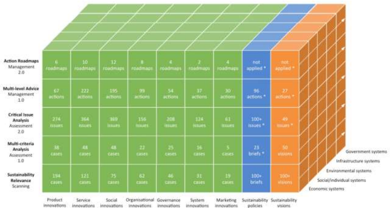
CASI Sustainability Cube