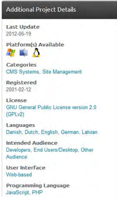
Figure 1. Sample Tags from SourceForge

Forge. In Section III, we elaborate our proposed approach. We present our empirical evaluation in Section IV. We discuss related work in Section V. Finally, we conclude and mention future work in Section VI.