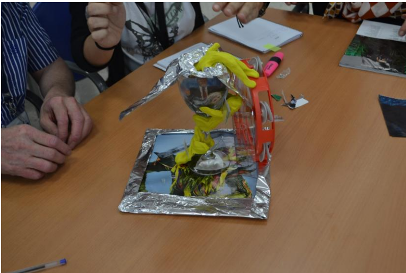
Figure 3. Artwork made by group 1.

The first group performed a work, which was titled "Art is below" and it was given the price of $50,000. It consisted of a hard platform as a base, taken from a magazine, a glass, human beings made of play dough, a kid's tambourine, a layer of silver paper and many portraits of people cut-out from newspapers (Figure 3).