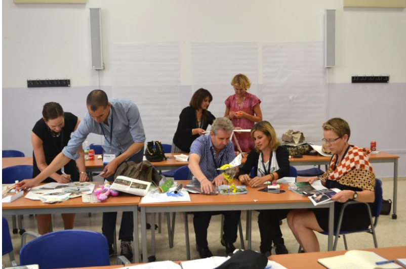
Figure 2. Participants doing the trial No. 4 during the workshop.