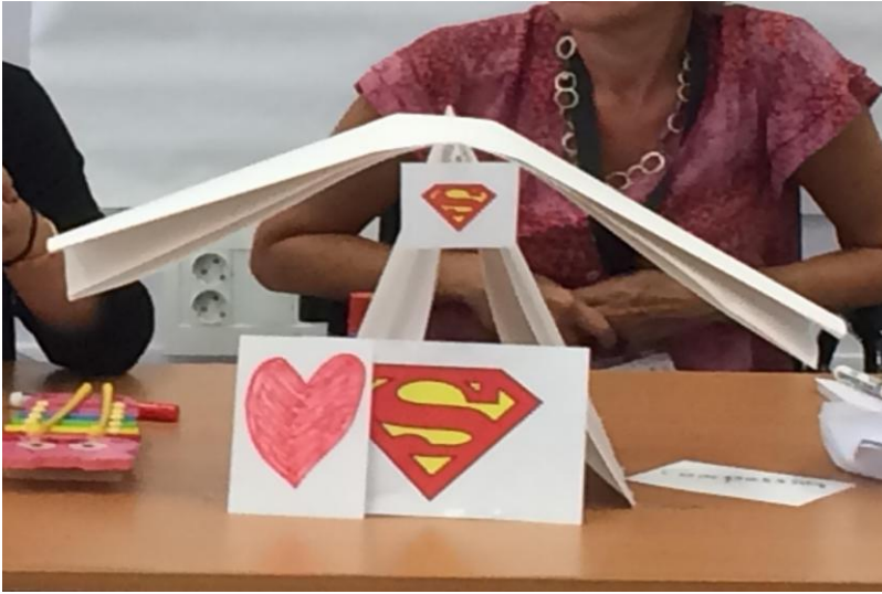
Figure 4. Artwork made by group 4.

As can be appreciated, they attempted a general balance of weights in which we must know how to measure very well what is best for the ideal art therapist depending on the situation depending on the patient to be treated. In this work appeared the icon of 'superman' as a strong superhero and out of the ordinary human, but also with a powerful heart from which to be feed.