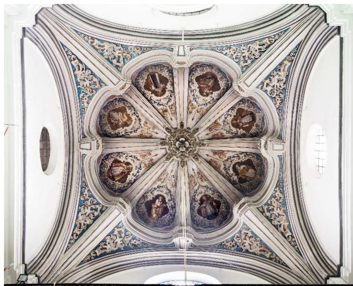
Figure 2. Church of San Andrés (Seville)

General image of the mural paintings at the Church of San Andrés (Seville).