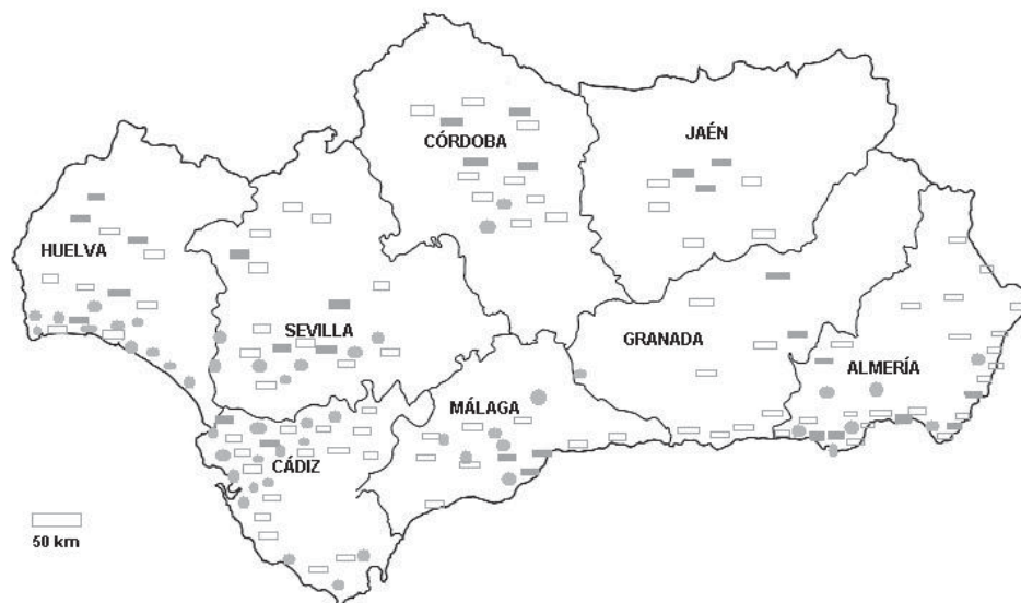
Figure 2. Approximate distribution of farm ponds and wetlands by administrative provinces compared in this study. Circles represent wetlands, rectangles represent farm ponds, and those shaded are the sampled ones for the present study. Distribución aproximada de las balsas de riego y los humedales según provincias. Los círculos representan los humedales, los rectángulos las balsas y los coloreados aquellos que se seleccionaron para el estudio intensivo.

a temporary stream; EXC, excavated farm pond with natural substrate; WET, natural wetlands of the Andalusia Wetlands Project; PLA, excavated or elevated farm pond lined with plastic; CON, excavated farm pond made of concrete. Percentage of submerged and emergent macrophytes was estimated and other characteristics were measured and identified in situ (total area of the pond, maximum depth, land use, water origin).