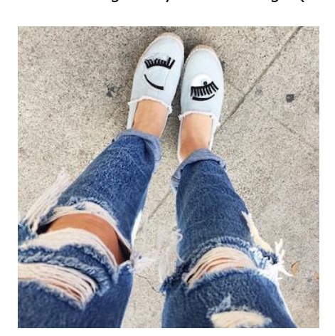
Image 6. Published on Instagram by Chiara Ferragni (12 January 2015)

Based on the results obtained, we have concluded that the most popular images amongst those analysed —the ones that received the most 'likes'— are those where you can see the blogger's full body against a significant background. The photo is taken with the camera at eye level angle and the predominant visual elements -either the young woman and/or the product - are placed at the centre. Additionally, the human figure stands out against the product, i.e., clothes and/or accessories. Warm colours are more widely used than other colours, as they transmit warmth and intimacy to the followers. Taking into account the former, it is consistent that users prefer themes where the blogger stands alone, as a model. Lastly, brands do not usually appear in an explicit manner in the photographs we analysed; that is, you cannot see a logo or brand name. However, this does not mean that followers do not know where the clothing in the images comes from, because complementary information is usually found in the descriptions of the photos or in the blog. Therefore, the image is used as a hook to lead the followers towards the complementary information that will allow them to purchase the clothing and accessories. We should also point out that the bloggers use their Instagram accounts for maintaining and promoting their influence. The reality is that these bloggers are personal brands in themselves and as such, they use visual composition elements to highlight their personalities.