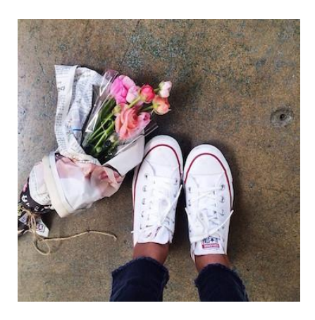
Image 2. Published on Instagram by Suri Sariñana (25 January 2015)

Before delving into the data on colour, we should reiterate that this value contemplated up to two dominant colours in the bloggers' photographs. In general, warm colours are predominant in the majority