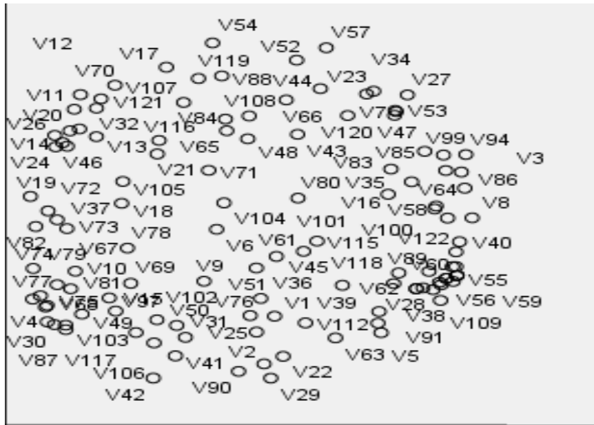
Figure 2: Cluster Map and Grouping by Axes