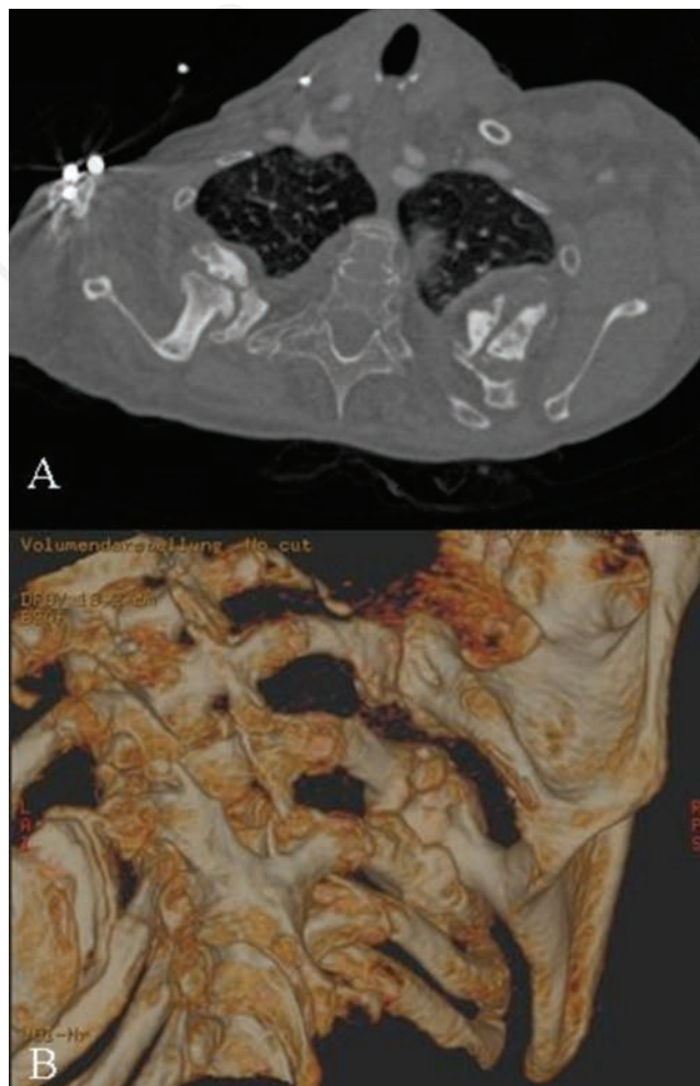
Figure 2. Axial (A) and 3D reconstructed (B) computed tomography scan showing an osteochondroma in the right scapulothoracic space.