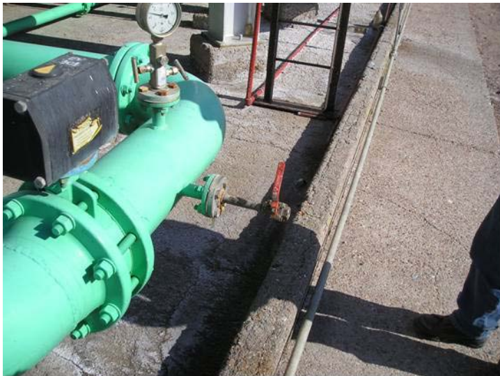
Figure 2-Valves show corrosion problems

The sulphide content at the entrance of the injector wells is very high. Lagged pipes are employed, where is paradoxally supposed not to have corrosion nor biofilms formation. The water treatment plant works discontinuously as there is a generalized problem of corrosion in the valves, (Figure 2).