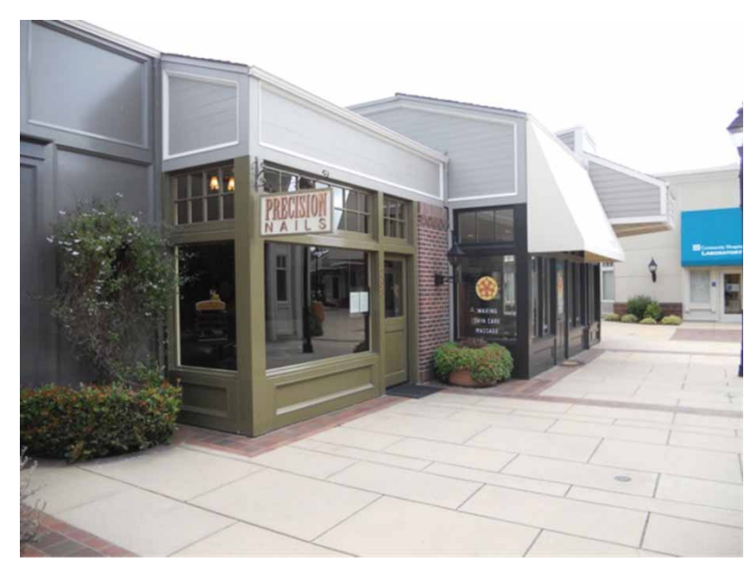
Figure 4 Storefronts at The Crossroads, formerly occupied by KRML studios and Jazz & Blues Company, 2011.

documentary that Ken Burns did on jazz may have something to do with it this year, along with the number of jazz festivals now." <sup>124</sup>