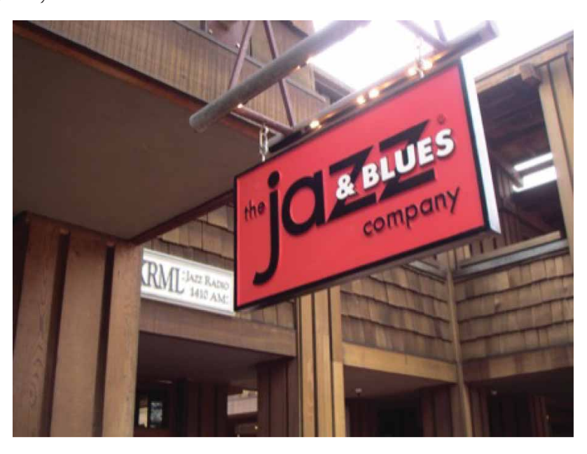
Figure 5 Signage at the Eastwood Building location, Carmel-by-the-Sea.

between Fifth and Sixth Avenues, overlooking the famed Hog's Breath Inn, and told his property manager to "make it happen" (Figure 5). "It's a station that belongs downtown," Eastwood stated. "I love the music they play, and it will be a fun addition to the neighborhood." <sup>125</sup>