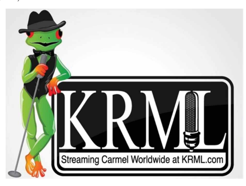
Figure 7 Dapper frog that represented KRML in its last days as a jazz broadcaster, 2012.

months after the purchase, the web site had links for both advertising and donations. 133