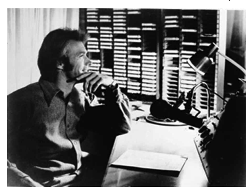
Figure 3 Clint Eastwood in the KRML studio, an image often used in station publicity.

Although there was to be no direct financial remuneration, Sam Salerno assented to Eastwood's request to shoot Misty in the KRML studios for the "notoriety," which has indeed proven beneficial. He notes that a still from the film, of Eastwood behind the KRML microphone, continues to figure in the station's publicity (Figure 3).