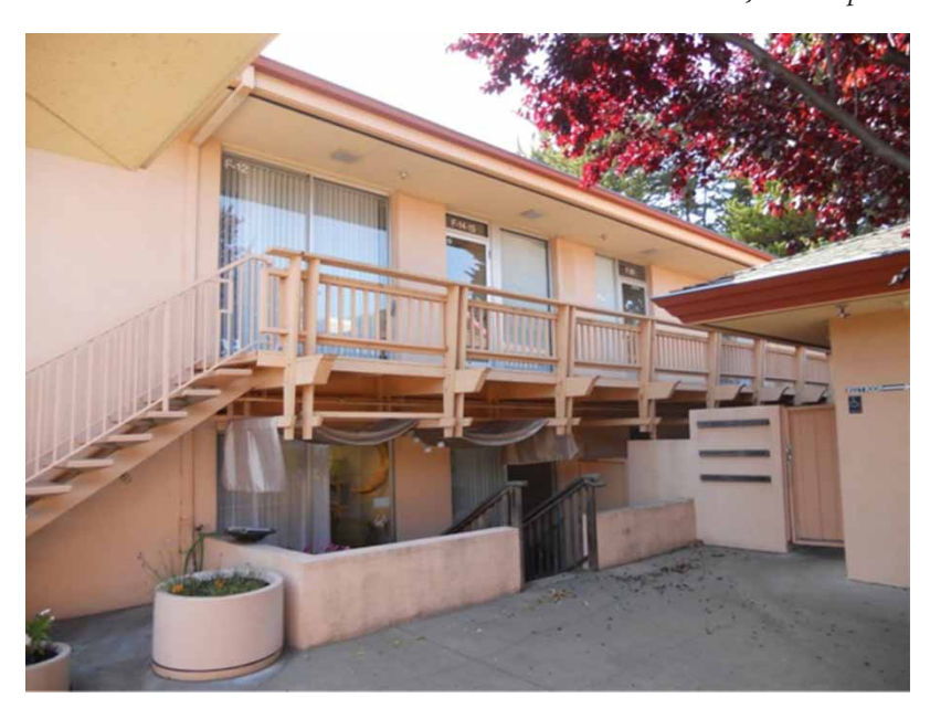
Figure 1 Two-room suite occupied by KRML studios from 1957 to 1994, in Carmel Rancho Shopping Center, 2011.