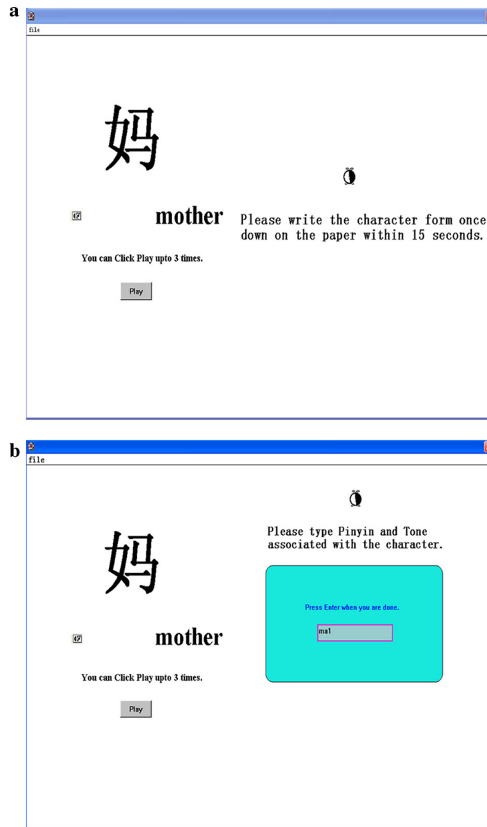
Fig. 1 Interfaces of two learning conditions. a Character-writing condition interface. b Alphabetic-code typing condition interface

tone (1, 2, 3 or 4) of each character. The maximum score (60) was earned by producing the correct pinyin onset, rime, and tone for each of 20 characters.