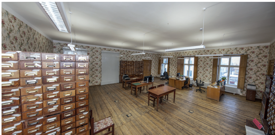
The Archives Reading Room after renovation works in 2013.