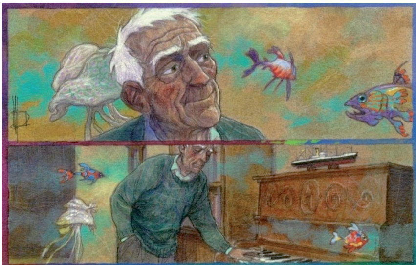
Figure 3. Prado (2012: 180)

Symbolized in the blue waves that flow into Fidel's home and the Galician valleys, the book's title refers to a real phenomenon, a long-distance wind that carries far inland the scent of salt and sea from the coast. The word itself is an invention of the author, and for the purposes of the book, the ardalén is made fantastical because it carries with it not just air and smells, but also stories, ghosts, and living creatures of the sea (Figure 3). The fish and whales appear oddly natural in the wet peaks and green valleys of Galicia. In other words, as the border between impossibility and verisimilitude becomes blurry, so does the border between land and sea. Prado's original inspiration for this story, the idea of a shipwrecked man who has never left land, further