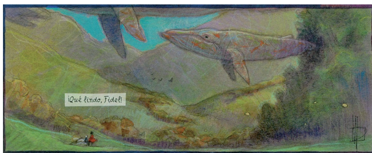
Figure 5. Prado (2012: 71)