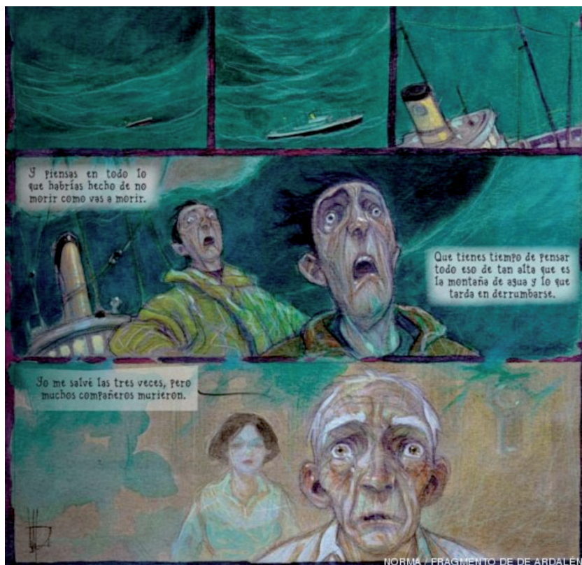
Figure 4. Prado (2012: 41)

Household objects also serve as catalysts for bringing the past back; listening to a shell brings Fidel's deceased shipmate Ramón back to him (Prado, 2012: 44). It is well known that people believe they can hear the sound of the sea in a conch shell, which is exactly what Fidel does, but in his case, he also hears the shell say, «Buenas tardes, Fidel» into his ear and Ramón's ghost enters the room (Prado, 2012: 44). The conch shell becomes even more interesting when we realize that Xana, the blonde woman whose spectral image had appeared along with the sounds of the radio, is responsible for refilling the shell with seawater when Fidel has exhausted its sounds (Prado, 2012: 50). The shell comes from the sea, of course, but it also brings people back from the bottom of the sea, and apparently contains actual seawater rather than just the echo of the listener's pulse. In an additional resonant metaphor, Ramón accuses Fidel of trying to «beber la tristeza a tragos», which suggests that Fidel thirsts for, but suffers when he absorbs, the water (the past) around him (Prado, 2012: 81). Finally, we