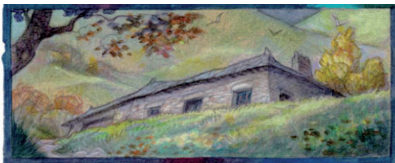
Figure 1. Prado (2012: 18)

action within the building — we know where the characters are. It also gives us visual clues about the scene's location in time, as we see a home increasingly decay and fall into disrepair, for instance (Prado, 2012: 141). Several of these long shots of buildings also represent the moment in which one character leaves the building, highlighting the isolating feeling that accompanies the end of characters' time together in a depopulated area, and recalling again Nora's emphasis on the importance of place in establishing community remembrance (Figure 1).