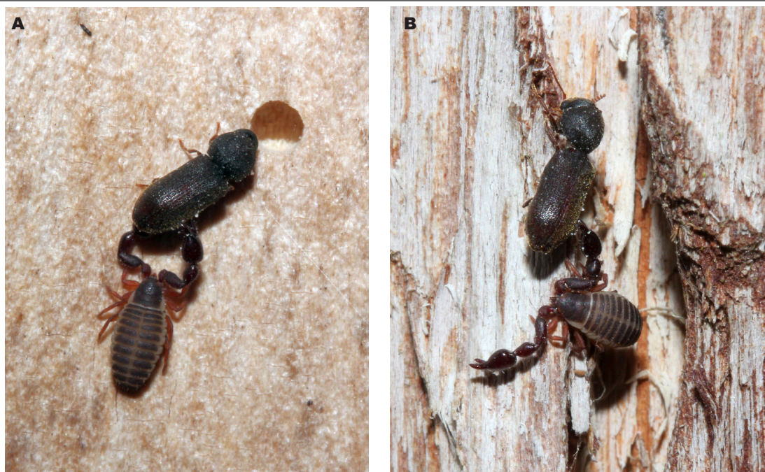
Fig. 2. Dendrochernes cyrneus hunting for Ptilinus pectinicornis females.