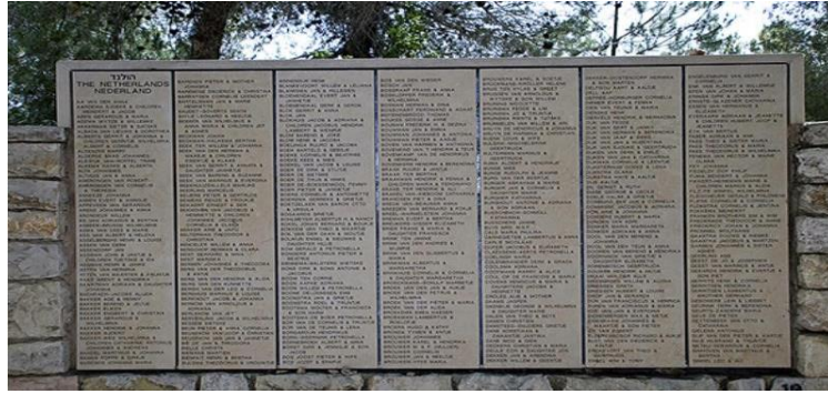
Figure 20. A portion of The Wall of Honor at Yad Vashem. ("Bogaards Family."Yad Vashem)