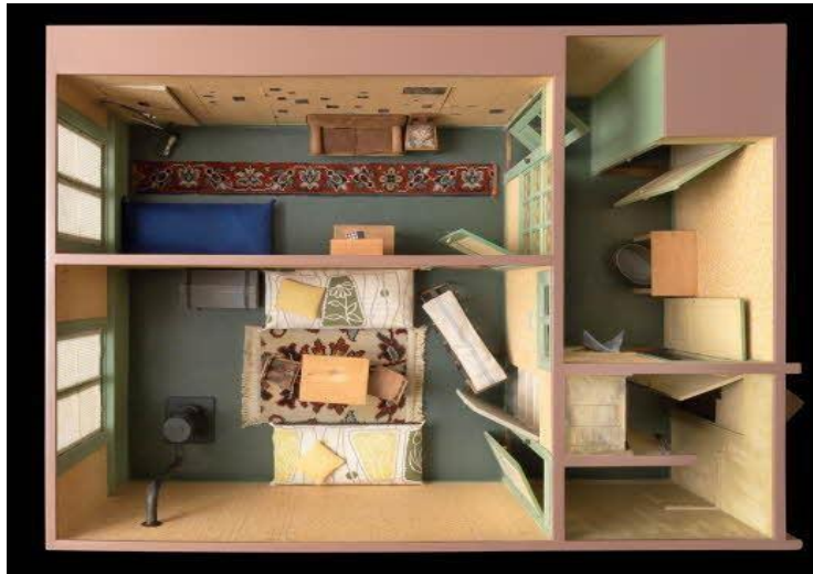
Figure 9. A model of the second of the three floors used as the Secret Annex. The room that Anne Frank shared with the dentist Fritz Pfeffer is on the upper left.