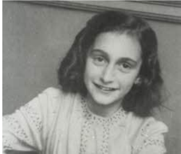
Figure 6. Anne Frank in June, 1942.