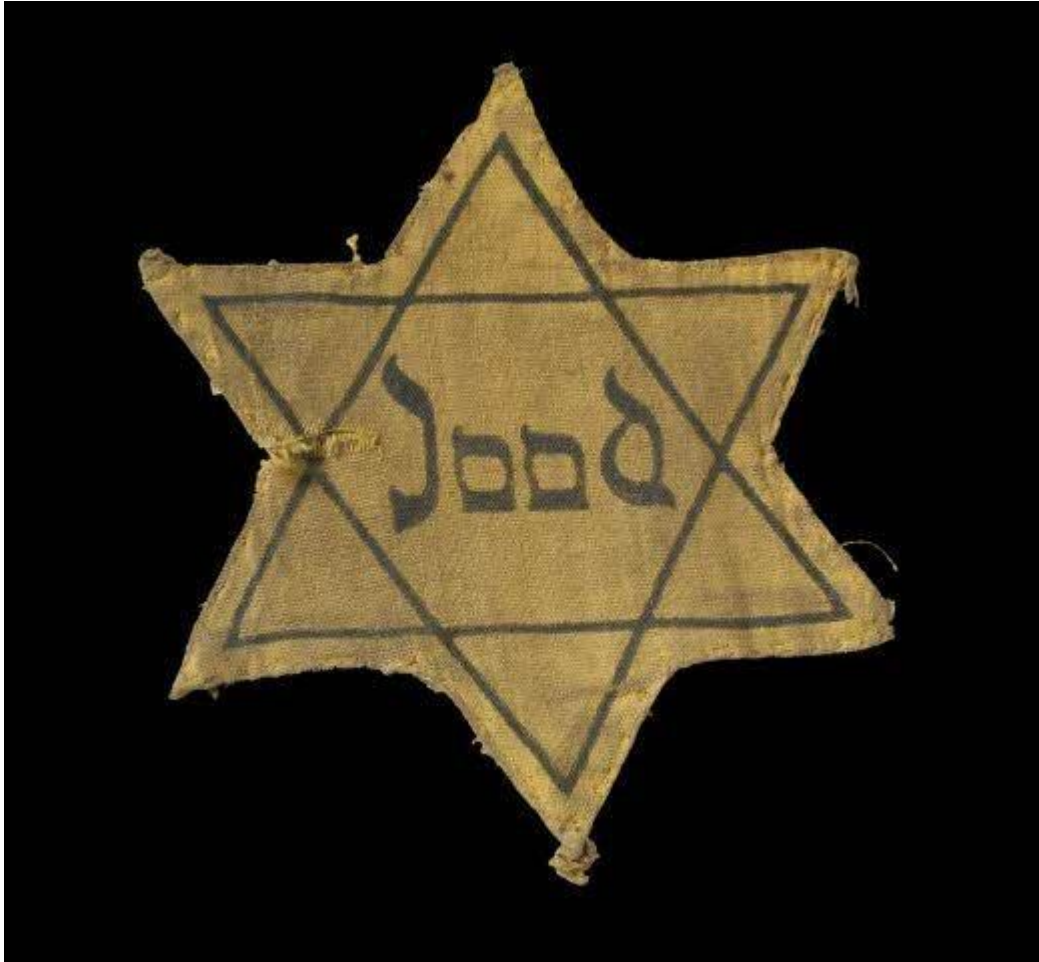
Figure 8. Photo of an actual yellow star used in Holland.

they were required to wear a yellow star so they could easily be distinguished from the rest of the population. The Dutch version of the yellow star was a slight variation on the German one: in Germany, the star had the word Jude emblazoned on it, written in a poorly executed approximation of Hebrew lettering in order to be as degrading as possible. The Dutch stars were imprinted with the Dutch translation: Jood .