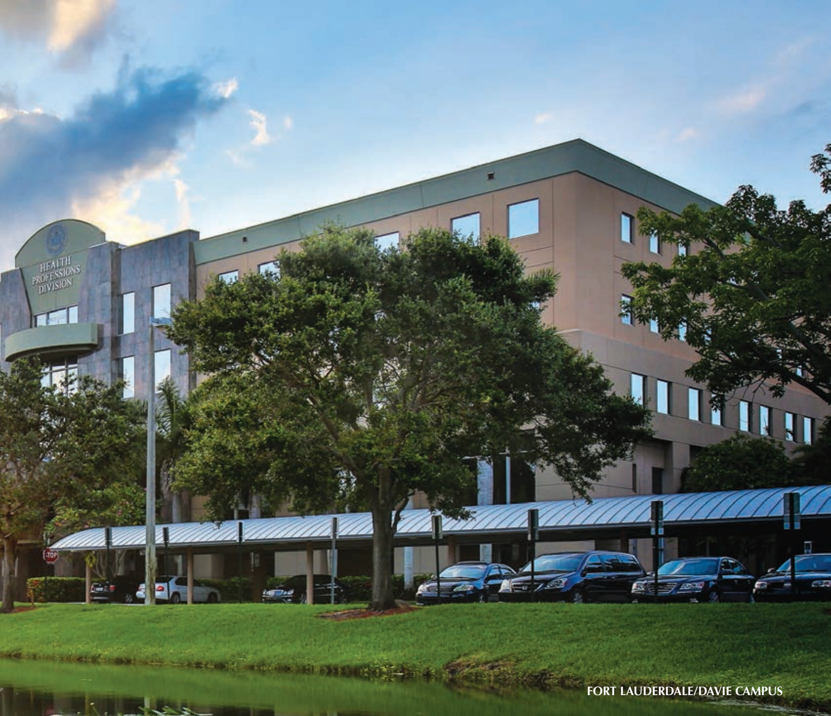
FORT LAUDERDALE/DAVIE CAMPUS

bachelor's, master's, educational specialist, and doctoral degrees in a wide range of fields including the health professions, law, business, marine sciences, psychology, social sciences, computer and information sciences, and education.