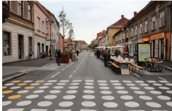
Fig. 12: Koroška street with the dotted street crossings, that were erased and replaced by the classic ones just after the European Mobility Week 2015.

(9) ‘Lent festival - OPEN Koroška 2016’ – still once a year as a part of the yearly summer festival (Lent Festival), Koroška street is closed for traffic. Similar to the first event in 2015, it aims to open new perspective on the street, to enable genuine physical experience of the street without the traffic and to walk in the middle of the street, to dance in the middle of the street, to play football on the street in the middle of the city centre. It will be closed again on 25 June 2017.