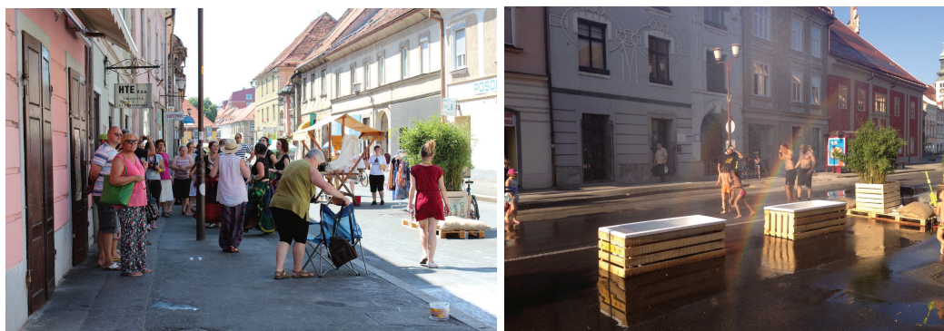
Fig. 8 and 9: Open Koroška street – test event in 2015