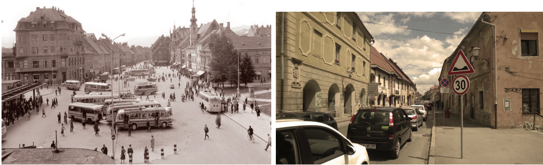
Fig. 1: Main square and Koroška street as shared spaces in 1961. Fig. 2: (right): Motorised traffic at Koroška street in 2015