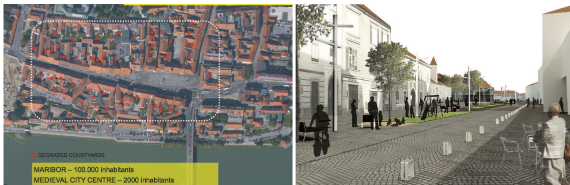
Fig. 4 (left): Old city centre of Maribor with Main Square and Koroška street. Fig. 5 (right): Koroška street according to architectural competition of MX_SI architects, Boris Bežan and partners

(7) ‘Architectural and urban planning competition for the wider area of the Main square, Koroška street and Kneza Koclja street’ in 2010. The competition results divide the area by three different solutions of three architectural teams. The one for Koroška street is designed by the Slovene-Mexican architects (MX_SI architects), Boris Bežan and partners (competition is organised by the Chamber of Architects, Municipality of Maribor, Architects Association Maribor). It proposes a new ambient, with more space devoted for pedestrians along with the one-way street for motorised traffic (Fig. 5), (ZAPS, 2010).