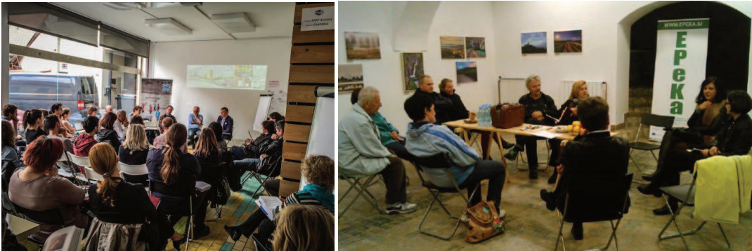
Fig. 6 (left): 2 nd Urban Hackathon – Reviving Koroška street in 2015. Fig. 7 (right): Inhabitants meeting of Koroška street

together’), April 2015 (‘Reviving Koroška street’) and October 2015 (‘Reviving the city centre’) of 2015 with 40-60 participants at each event. All three hackathons were organized with an intention to activate, inform and empower those willing to support urban change in the area. There was a conscious attempt to merge different groups of stakeholders. Consequently, all three hackathons were characterized by a broad variety of participants, ranging from municipal officials, university researchers (architect and traffic engineers), experts from different fields of urban development, representatives of NGO’s, civil initiatives (e.g. Initiative City Council), students and most importantly by local people who were interested in helping to solve the problems of their own living environment. (Pogačar, Žižek, 2016)