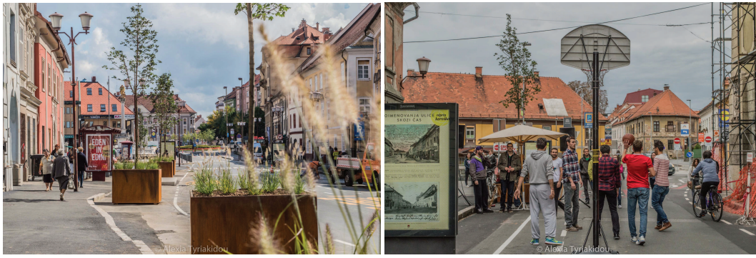
Fig. 10 and 11: Koroška street with the new interim appearance at European Mobility Week 2015.