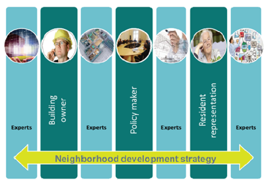
Figure 2: schematic representation of the iterative process of neighborhood development strategy (Salzburg University of Applied Sciences)

The method of workshops was chosen because it provides the opportunity to work on many different topics and problems in a short period of time. The involvement of experts and relevant stakeholders as a valuable resource of knowledge and experience as well as a high degree of interaction secure an arranged approach in the development process. Utilizable results and valuable input can be deducted and allow a refinement of the neighborhood development strategy. Moreover, workshops enable a clarification of opinions and the identification and discussion of different perceptions. In an iterative process, all information was collected, structured, combined and evaluated. The result of this collective effort is a common understanding among the stakeholders.