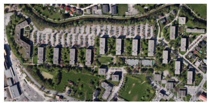
Figure 1: aerial view of the reference neighborhood

housing approximately 2,500 inhabitants in 1,257 apartments on a gross floor area of almost 100,000 m². Figure 1 offers an aerial view of the neighborhood.