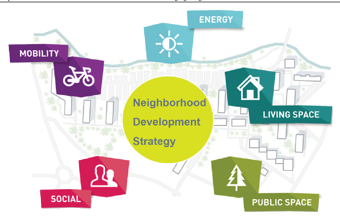
Figure 4: five key area of action (Salzburg University of Applied Sciences)