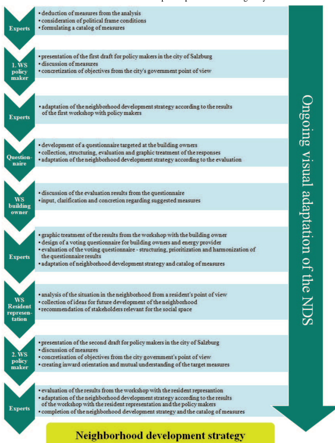
Figure 3: workflow of the iterative process of the neighborhood development strategy (Salzburg University of Applied Sciences)

Based on this iterative harmonization and prioritization process, five key areas of action (energy, living space, open space, social and mobility) have been identified. They are visualized in Figure 4. For each key area of action, an illustrative icon with a high recall value is designed.