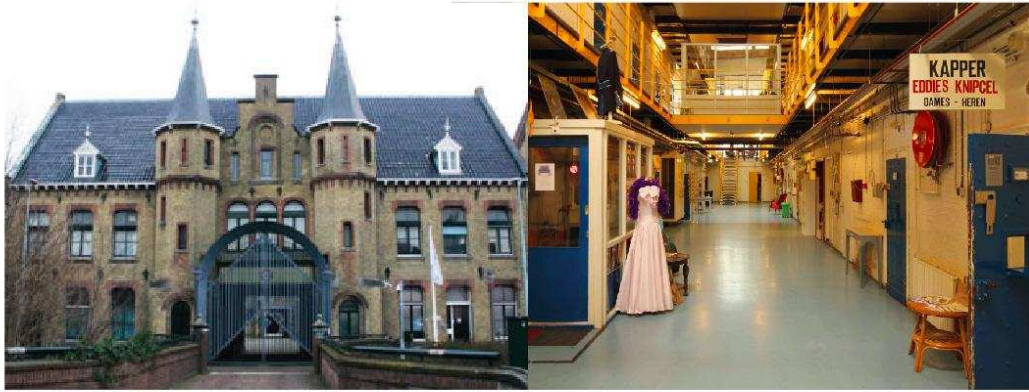
Figure 2. Blokhuispoort exterior and interior, www.blokhuispoort.nl , 2014