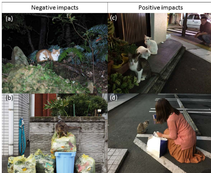
Fig. 1. Example of negative and positive impact of outdoor cats in Amami Oshima Island. (a) Negative impact, outdoor cats that live in the forest are predators of wildlife. (b) Negative impact, outdoor cats cause trouble in the Town and Rural neighborhoods. (c) Positive impact, people enjoy watching outdoor cats. (d) Positive impact, our quality of life and tourist's experience are made better by cats, especially for cat lovers.