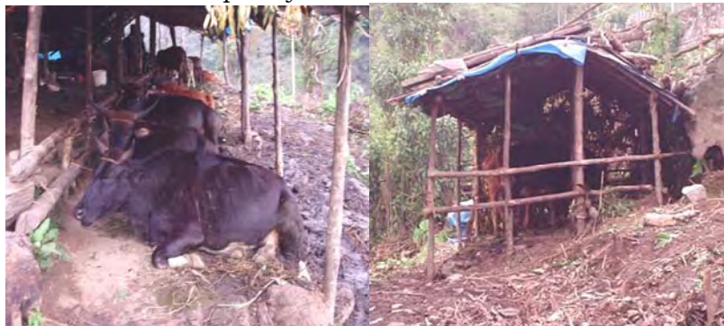
Fig. 2 Temporary housing of cattle at the village farms Breeding management

Most farms (67 percent) had temporary housing for adult cattle and calves made of wooden poles, singles (crudely-made planks) with bamboo mat and plastic sheet for roofing. Sixteen percent had semi-permanent houses made of roughly finished timber, with stone or plank flooring. Rooves were made of bamboo mat or banana leaf, which were invariably covered with plastic sheet (Fig. 2). The external plastic sheets were clamped with poles, tree branches and stones. Seventeen percent of farms did not have housing for adult cattle but had temporary sheds for calves.