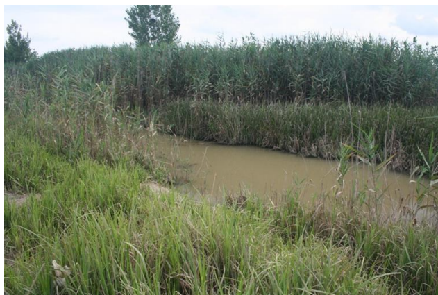
Fig. 6. Habitat of Hemiculter leucisculus , a canal that drains to Tajan River, Southern Caspian Sea basin.