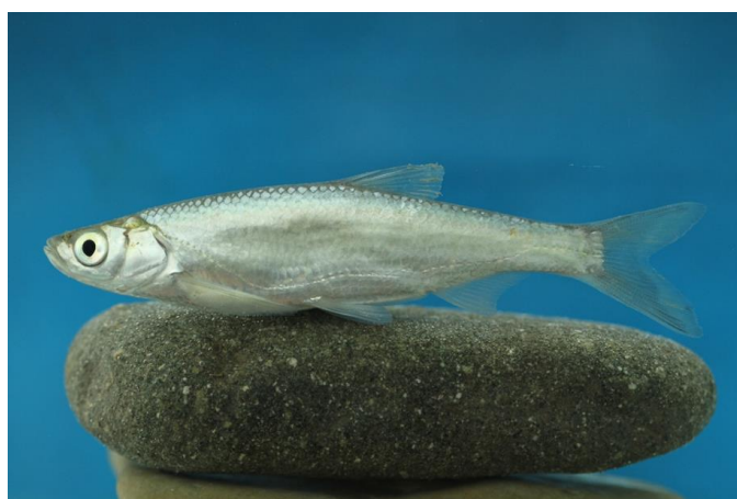
Fig. 5. Hemiculter leucisculus from a canal that drains to Tajan River, Southern Caspian Sea basin.

Despite wide distribution range of introduced H. leucisculus (Figs. 1 & 3), the native fish A. caeruleus has narrow distribution range in the world and in Iran (Figs. 2 & 4). It is distributed in Qweik, Euphrates and Tigris drainages from Southern Anatolia to Iraq (Freyhof, 2014). There are few records from Iranian sub drainage of Tigris. This paper reports for the first time, the occurrence of A. caeruleus in two new localities including Chardaval River (Figs. 8 & 9), Shirvan, (Karkheh River system, Tigris River basin) and Maroon River (Jarrahi River system). It was interesting that for a long time A. caeruleus was not reported from Iran. However, Abbasi (2009) recorded it from the Gamasiab and Doab rivers (Tigris River Basin). Similarity of this species to Alburnus hohenackeri and its low population may be the main reason for these late records. Alburnus caeruleus inhabits in the streams, rivers and lakes with moderate to slow current and reservoirs. Most likely sensitive to low temperatures as this species is, they are absent from the northern headwaters of Euphrates in Turkey (Freyhof, 2014). Human-mediated fish introductions may increase faunal similarity among primary drainages due to a strong tendency for taxonomic homogenization caused primarily by the widespread introduction of cyprinid fishes (e.g. Cyprinus carpio , Hypophthalmichthys molitrix , H. nobilis , Pseudorasbora parva , Carassius auratus ), and poecilid fish ( Gambusia holbrooki ).