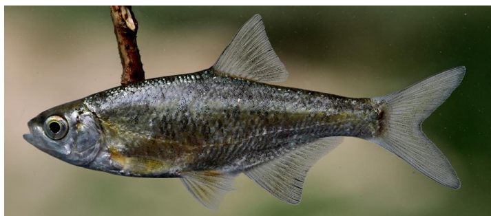
Fig. 8. Alburnus caeruleus from Chardaval, Karkheh, Tigris River basin, Iran.