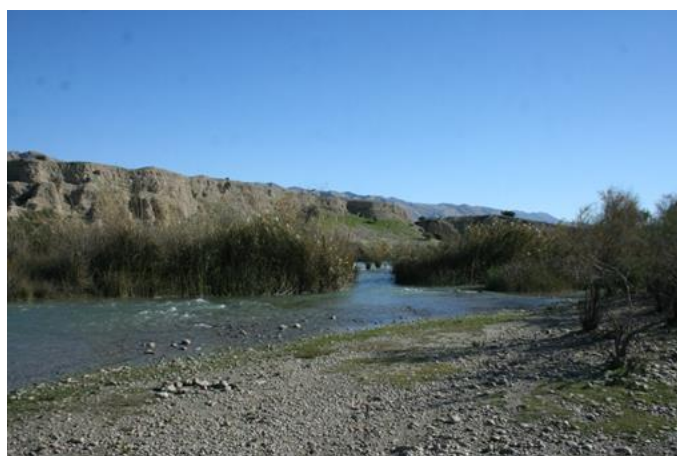
Fig. 7. Maroon River new locality record for Hemiculter leucisculus .