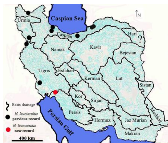
Fig. 3. Distribution map of Hemiculter leucisculus in Iran.