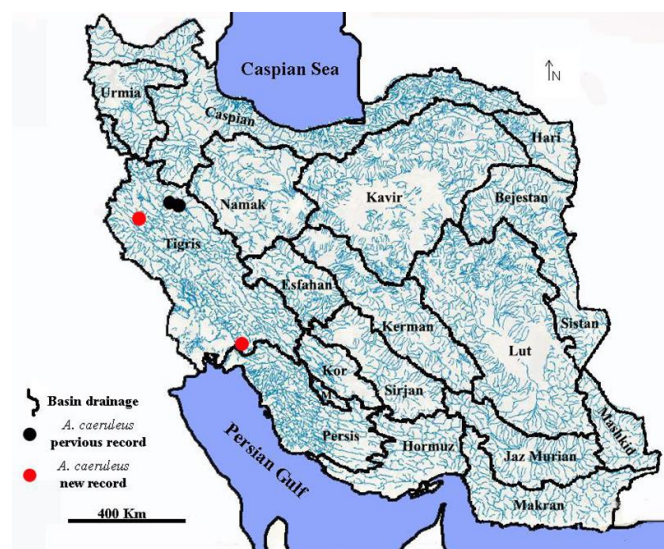
Fig. 4. Distribution map of Alburnus caeruleus in Iran.