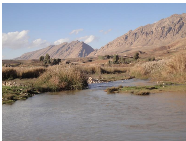
Fig. 9. Chardaval River (Karkheh River system), new locality record for Alburnus caeruleus .