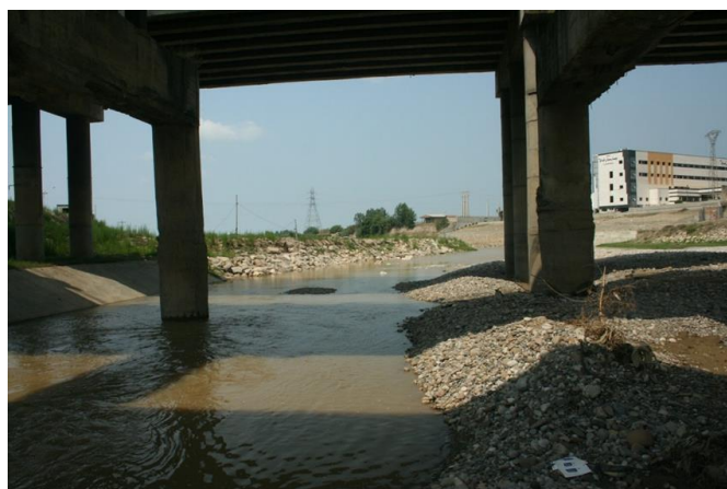
Fig. 10. Anthropogenic disturbance in freshwater ecosystem in Iran (Talar River, Southern Caspian Sea basin).

of disturbance associated with human settlement, infrastructure and change in land use (Fig. 10).